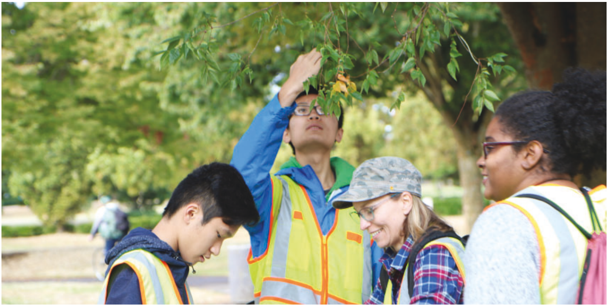
Volunteers work in teams to collect data on park trees in the Tree Inventory Project.