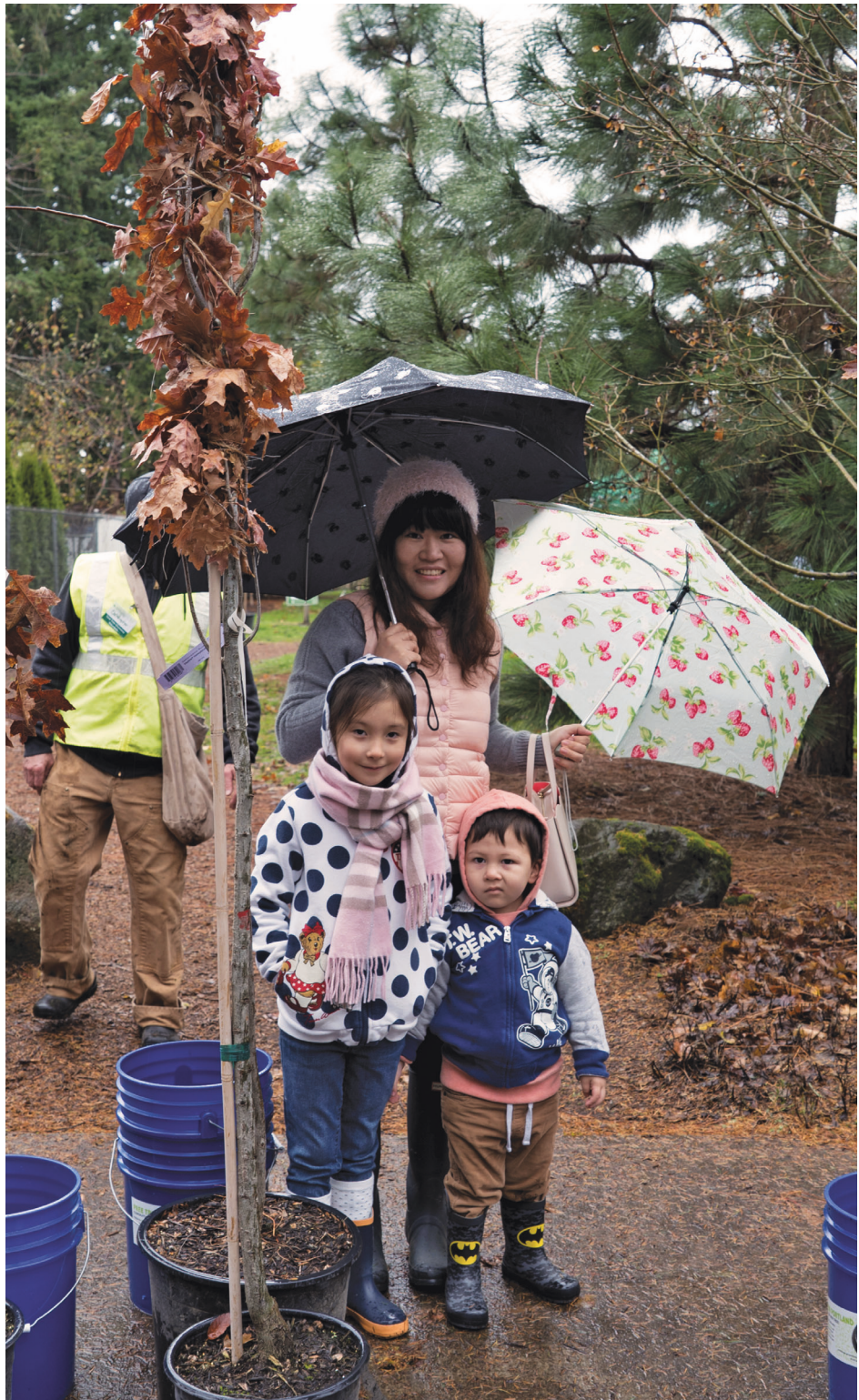
Portlanders planted nearly 600 trees through Urban Forestry's Yard Tree Giveaway in 2017-2018.