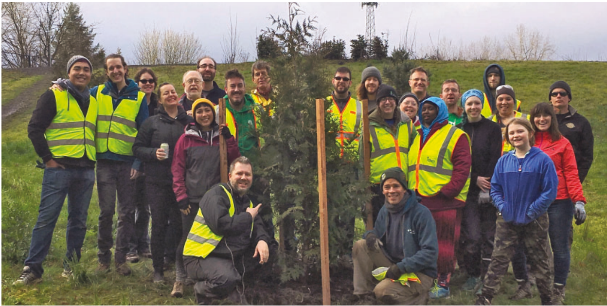
Volunteers planted ten native trees in Chimney Park.