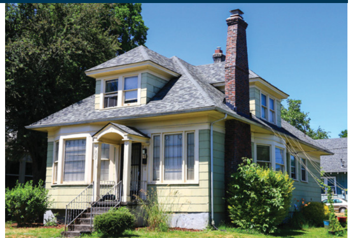
Rutherford House National Register Resource

Since the passage of the 1966 Historic Preservation Act, the National Park Service has provided best practice guidance for documenting, designating, and protecting historic resources. The Park Service maintains the National Register of Historic Places, the nation's official list of buildings, structures, sites, objects, and districts that are significant in different areas of American history. For properties listed on the National Register, a federal income tax credit is available for rehabilitation projects. In general, the Park Service does not apply preservation regulations to National Register resources and leaves protection decisions to state and local governments.