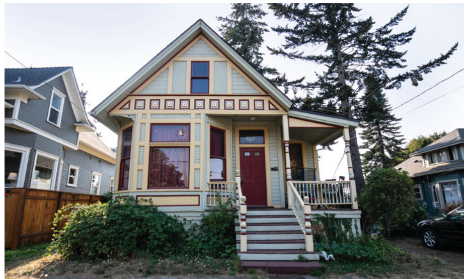
A preserved house in the Woodlawn Conservation District