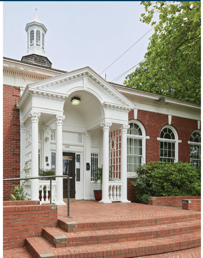
Arleta Branch Library Historic Landmark

If not for State regulations, the proposed zoning code amendments would eliminate owner consent requirements for local historic resource designation and provide only a 120-day demolition delay period for resources listed in the National Register in the future. Should state law change during the 2019 legislative session, the proposed draft of the code proposals will incorporate those changes.