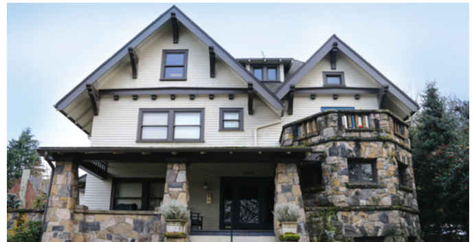
Moulton House Conservation Landmark