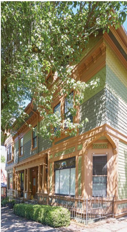
A restored 4-plex in the South Portland Historic District