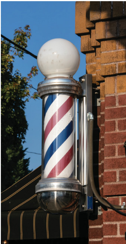
A small sign in the Kenton Historic District