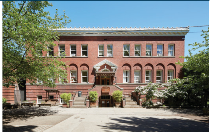
Neighborhood House, a Historic Landmark built by the National Council of Jewish Women.

Staff requests that feedback and survey responses be submitted by April 1, 2019. We encourage you to include a bulleted list that addresses specific concepts and/or code citations when submitting written comments.