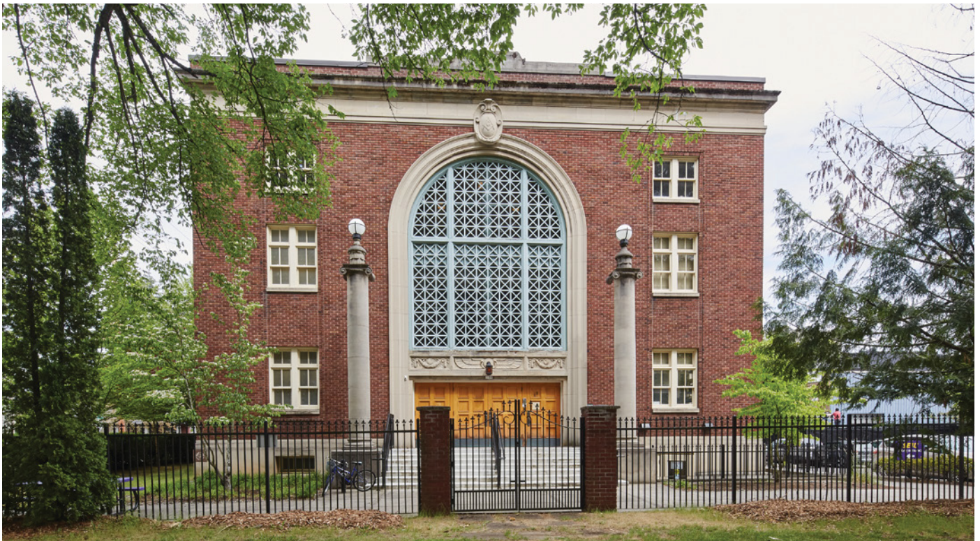
Palestine Lodge, a Historic Landmark in SE Portland