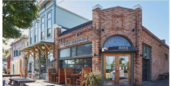
Woodlawn Conservation District