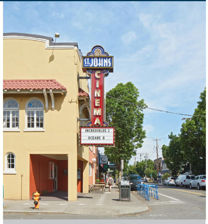
Venetian Theater HRI Resource

The 2035 Comprehensive Plan includes numerous policies related to historic resources, ranging from emphasizing cultural resources to updating the Inventory in areas of the city that have been under-represented in the past. These zoning code proposals seek to align the code with the policy direction provided in the Comprehensive Plan.