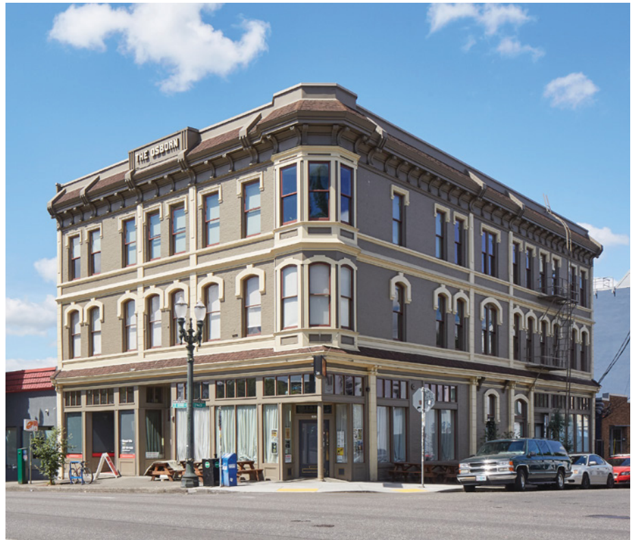
A rehabilitated building in the Grand Avenue Historic District