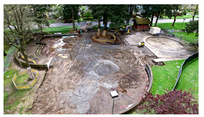
LENTS PARK DURING CONSTRUCTION

The Oversight Committee's recommendation last year to Portland City Council and PP&R was the establishment of a contingency to ensure that projects were completed. The Committee is pleased with the establishment of a $2 million contingency fund. This ensures that commitments to Portlanders will be fulfilled and improvements to safety will be prioritized and equitably distributed.