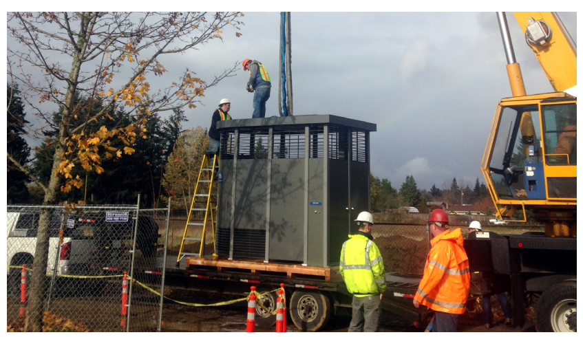
INSTALLING THE LOO AT PARKLANE PARK