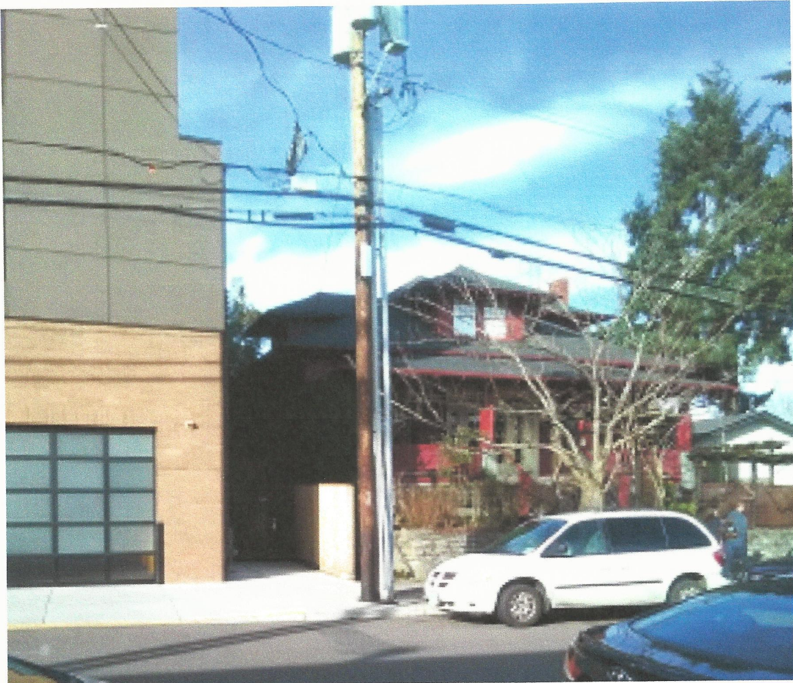
A single family home in the shadow of a 4-story mixed used building near SE 13th Avenue and Umatilla street.