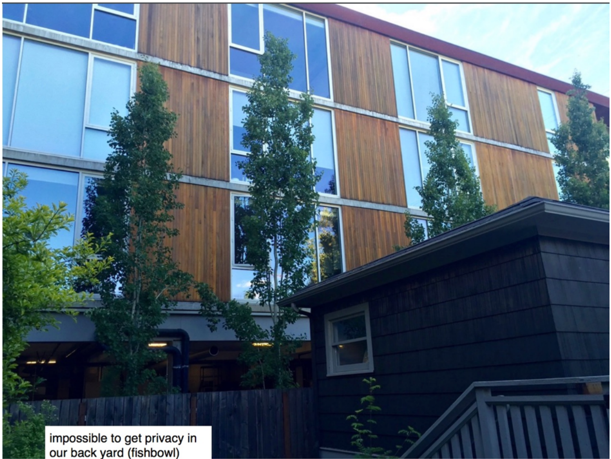
impossible to get privacy in our back yard (fishbowl)