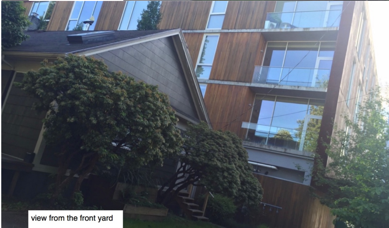
view from the front yard