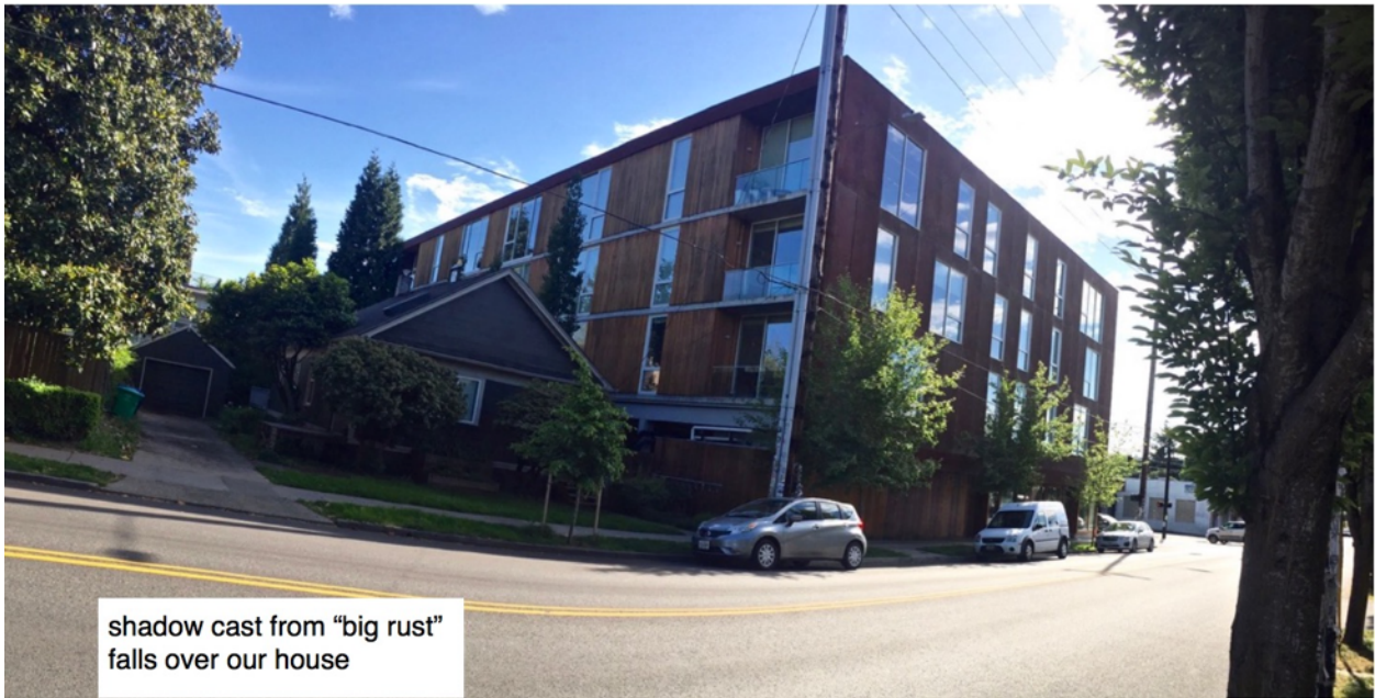
shadow cast from "big rust" falls over our house