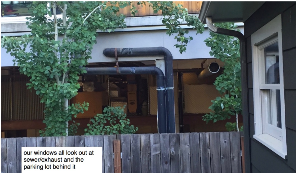
our windows all look out at sewer/exhaust and the parking lot behind it