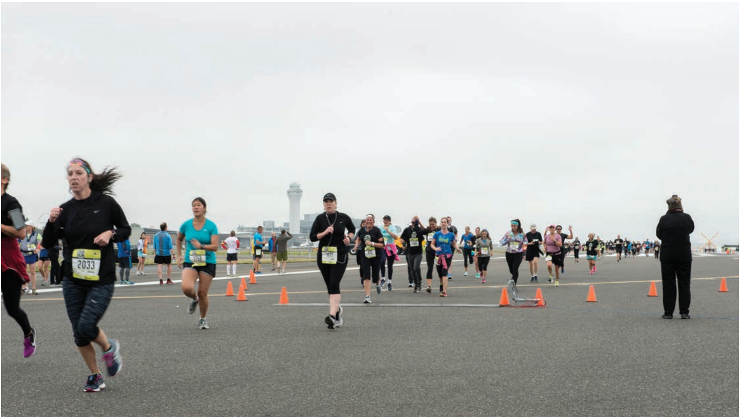
Connecting the community to the airport is one of the main interests of the PDX CAC. The PDX Runway Run brought the public onto the airport's north runway on September 24 and raised over $20,000 for the Boys and Girls Club of Portland Metropolitan area.