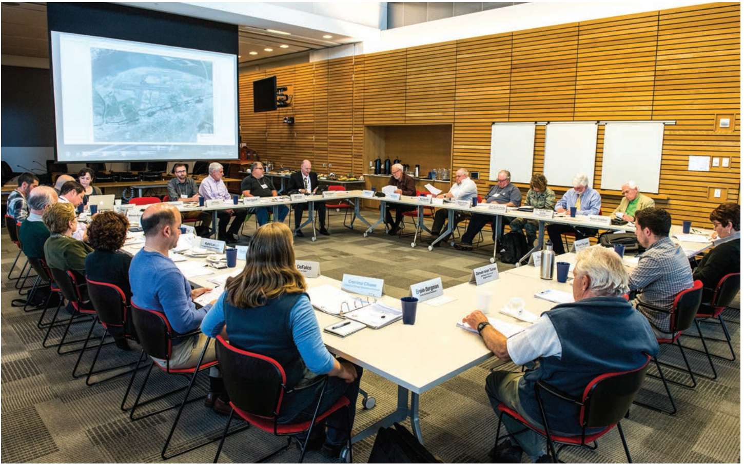
The PDX CAC meets quarterly to discuss and give input on airport planning, development and sustainability topics.