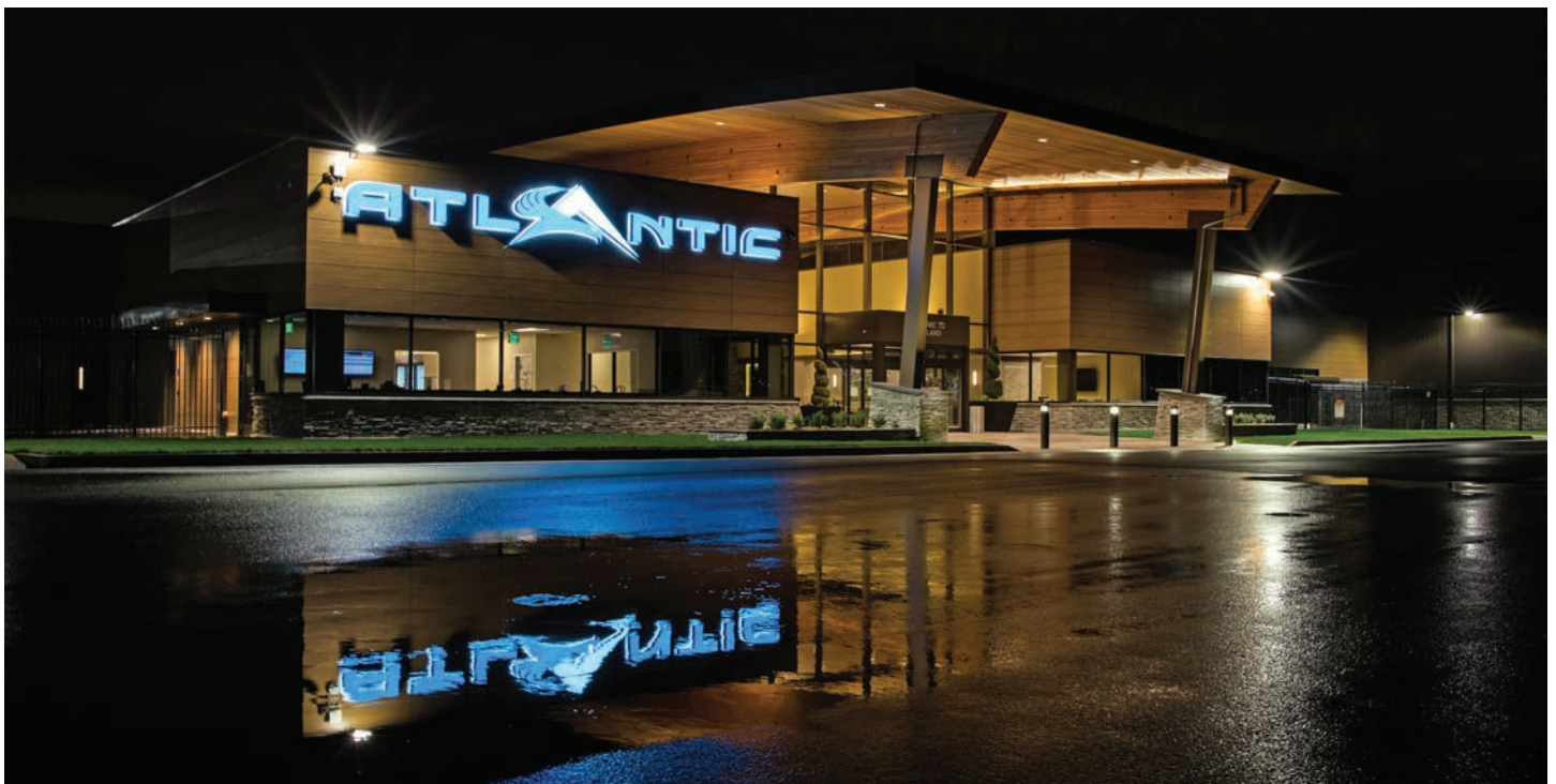
The new Atlantic Aviation facility opened in spring 2017. This general aviation project was presented to the PDX CAC for review and discussion, and included broad public notice consistent with plan district requirements.