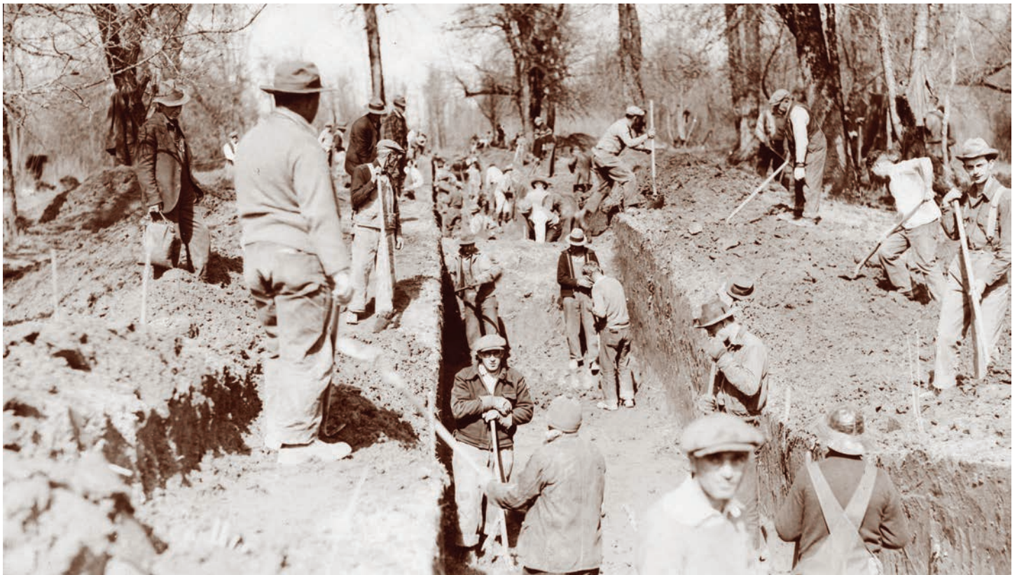
1936 WPA work crew installing a diversion drainpipe for airport fill placement, in preparation for construction of Portland International Airport. The pipe was recently replaced as part of the Colwood pipe replacement project.

CAC officers will present annual report to Port of Portland Commission on April 13.