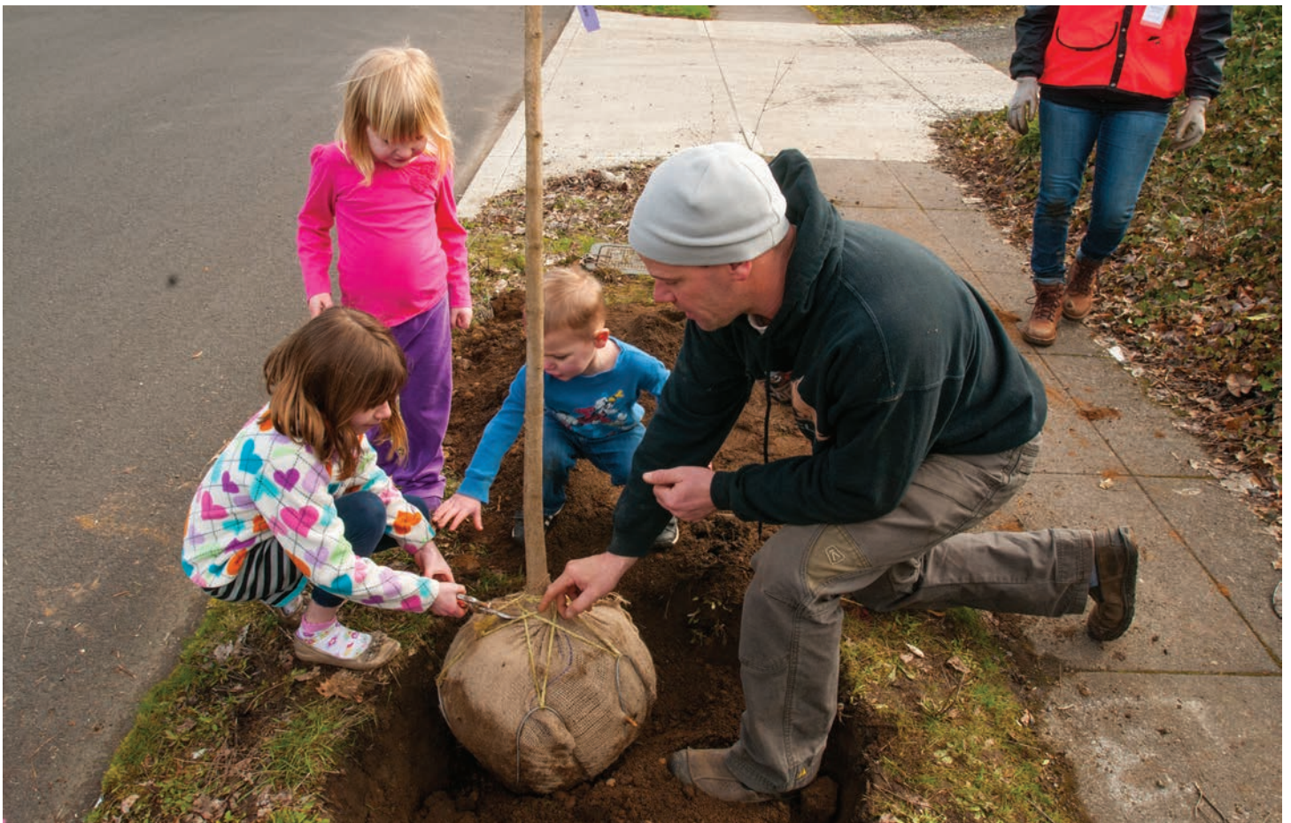
The Port sponsored Friends of Trees plantings in seven neighborhoods this fiscal year.

The first recommended project would provide funding to Friends of Trees for the next three years in order to implement multi-year natural area plantings at Columbia Children's Arboretum, the Columbia Slough Natural Area, and May's Lake and multi-year neighborhood tree plantings at non-owner occupied residential properties, with a focus on neighborhoods impacted by airport operations. These communities are Argay, Concordia, Cully, Parkrose, Parkrose Heights, Piedmont, Russell, Sumner, Vernon, Wilkes, and Woodlawn.