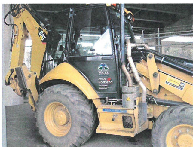
Example of vehicle with limited space.