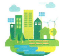
Table 7 below provides a comparison of the jobs breakdown of the construction phases of the proposed Westway/Imperium project and the hypothetical solar array. The results are clear: the solar array would create many more jobs, including many more construction jobs, than the oil terminals. The solar array would create 247 more construction or construction-related jobs, 147 more indirect, supply chain-related jobs, and 356 more total jobs, than the oil terminals.