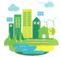
Table 11 below provides a comparison of the total jobs created through the operations phase of the Westway/Imperium fossil fuel terminal with those created by a comparably scaled investment in energy efficiency within Grays Harbor County. While solar PV operations alone are insufficient to create as many jobs as the terminal, the energy efficiency investment creates many more.

The energy efficiency investment creates 262 direct and 362 total jobs in Grays Harbor County alone. These figures exceed the job creation impact of Westway/Imperium by 114 direct jobs, and 62 total jobs. The vast majority of the direct jobs created by the energy efficiency investments will be in building maintenance and construction sectors.