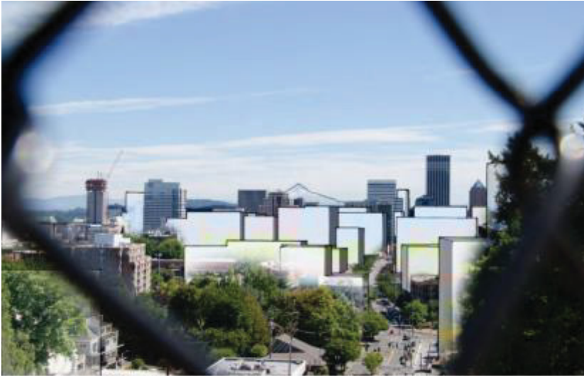
Figure 16: View of Central City and Mt Hood from SW15 – Proposed Bonus Heights

The views to Mt. Hood from the Vista Bridge are being threatened by the heights proposed in this draft.