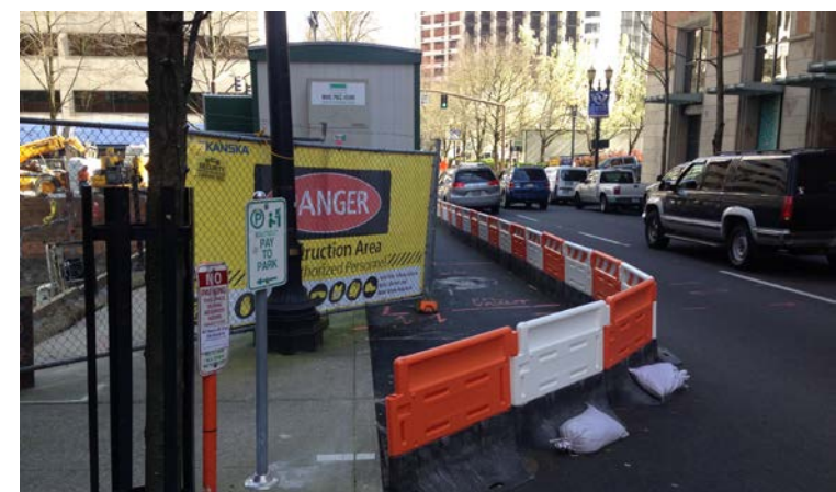
SW Columbia & 2nd