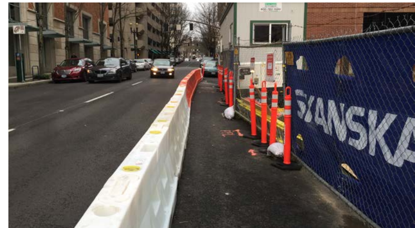
SW Columbia & 2nd