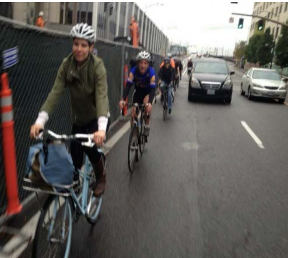
NW Broadway & Hoyt