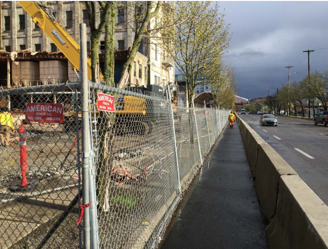
NW Naito & 9 th