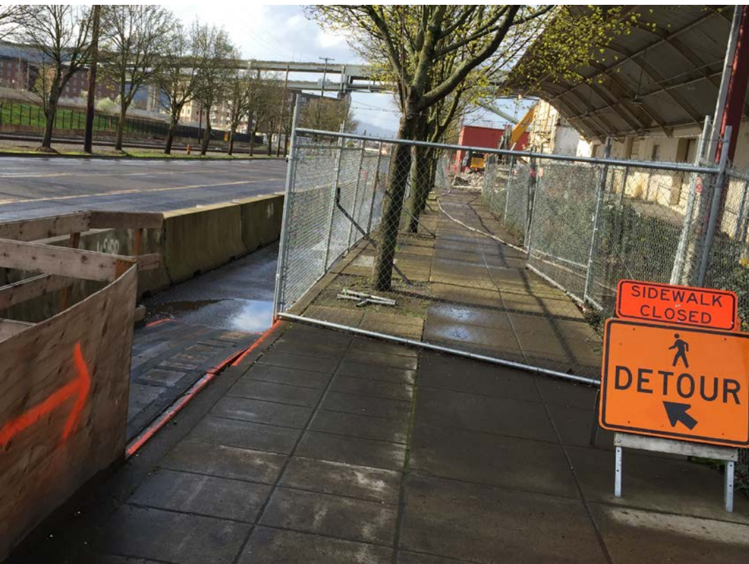
NW Naito & 9th