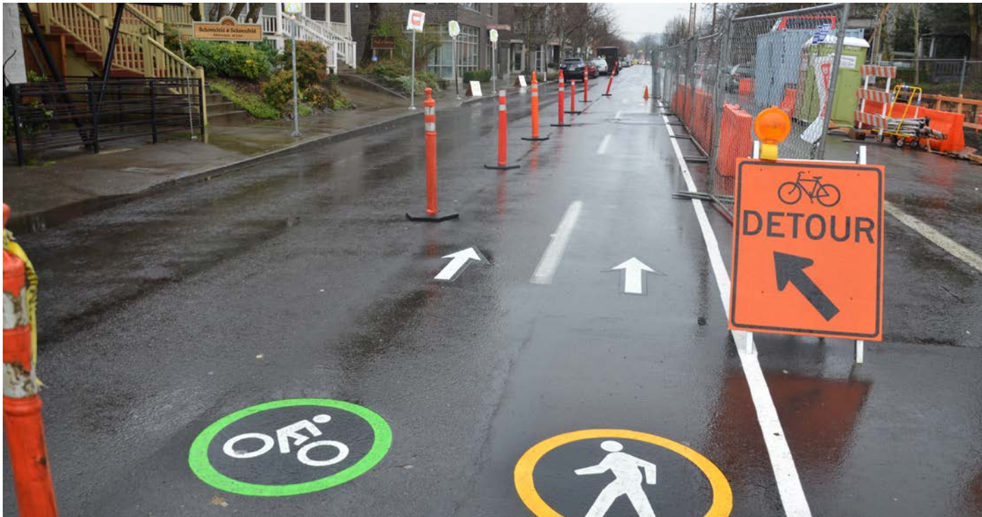
SE Belmont & 21 st Ave., 2-2-2016

These options may need to use on-street auto parking and auto travel lanes.