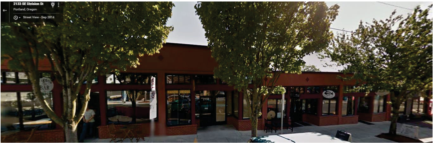
“Pearl on the String” Commercial Node- Cluster of Commercial at 20 th -22 nd & SE Division Street, including Bar Avignon, Mirador, New Seasons, and multiple eateries.