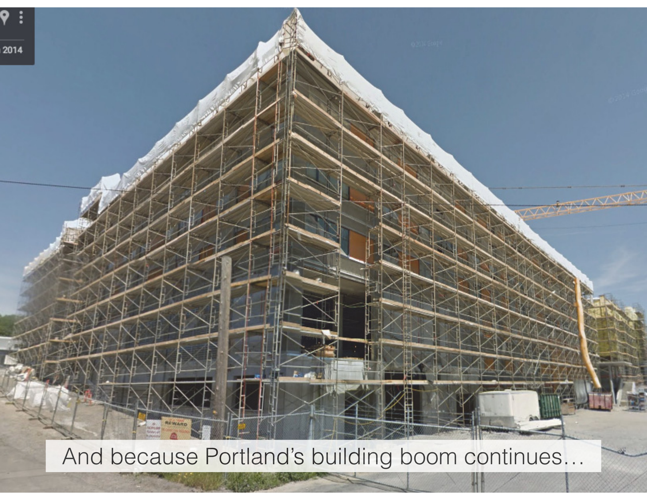
And because Portland's building boom continues...