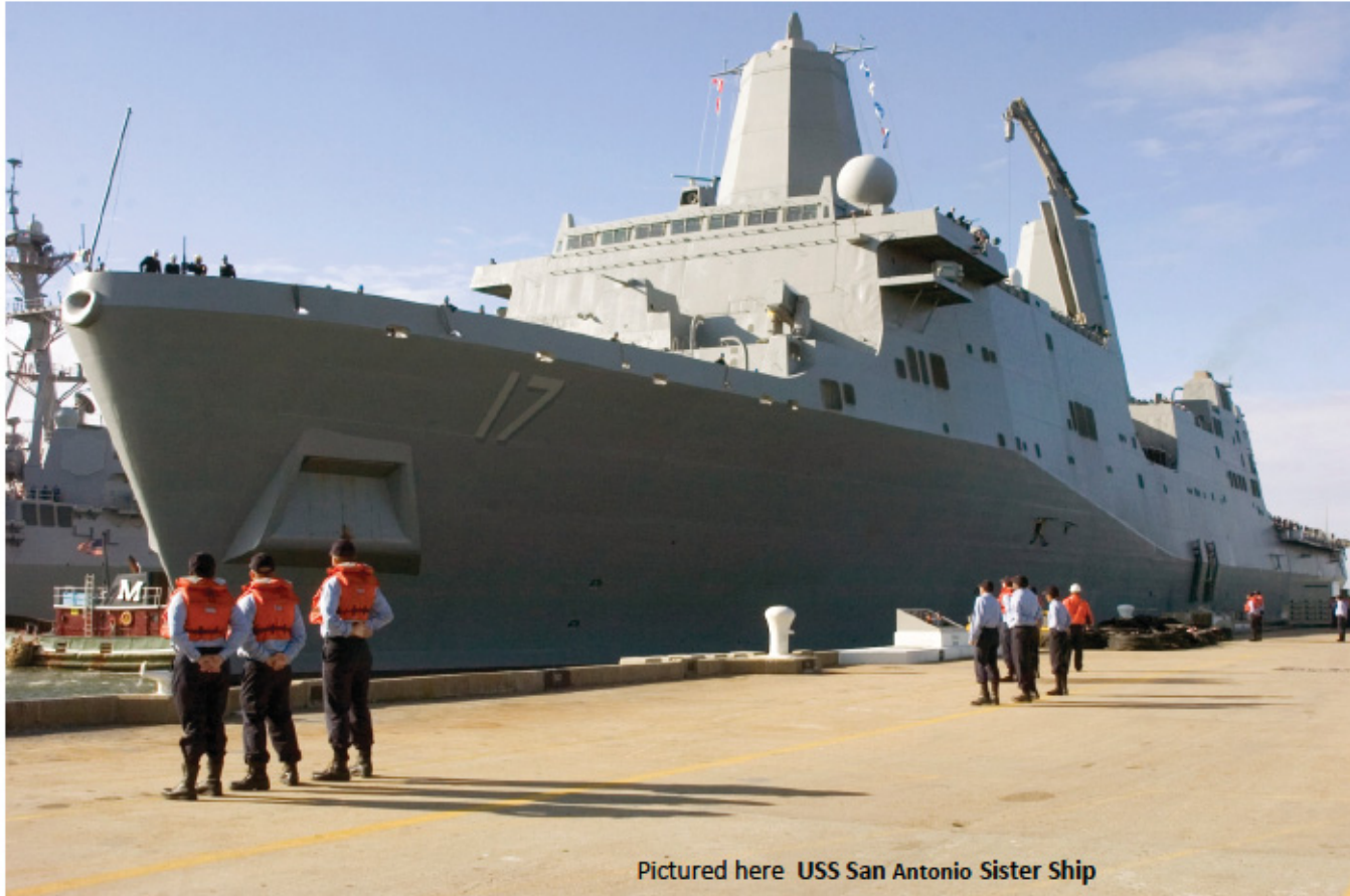
Pictured here USS San Antonio Sister Ship

Visit our Website: www.ussportlandlpd27.org