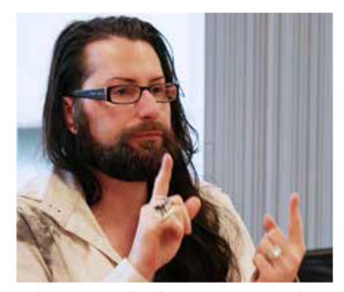
"This is just the beginning. I look forward to working on different items regarding deaf issues here in Oregon. This shows how important PCOD is as a voice for the disability community."