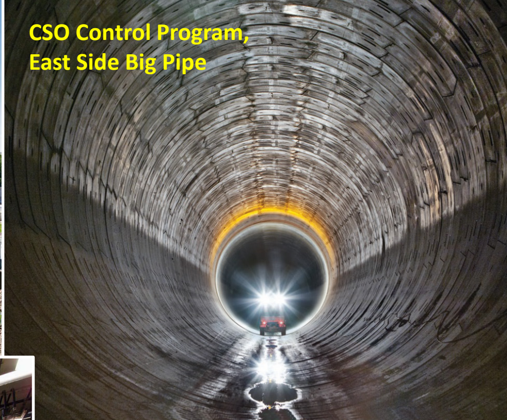
CSO Control Program, East Side Big Pipe