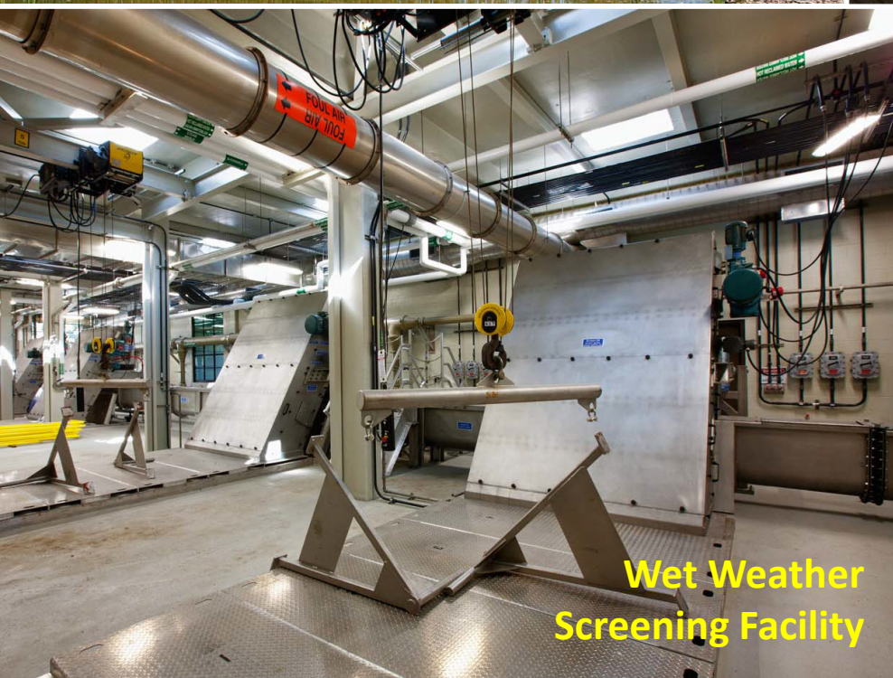
Wet Weather Screening Facility