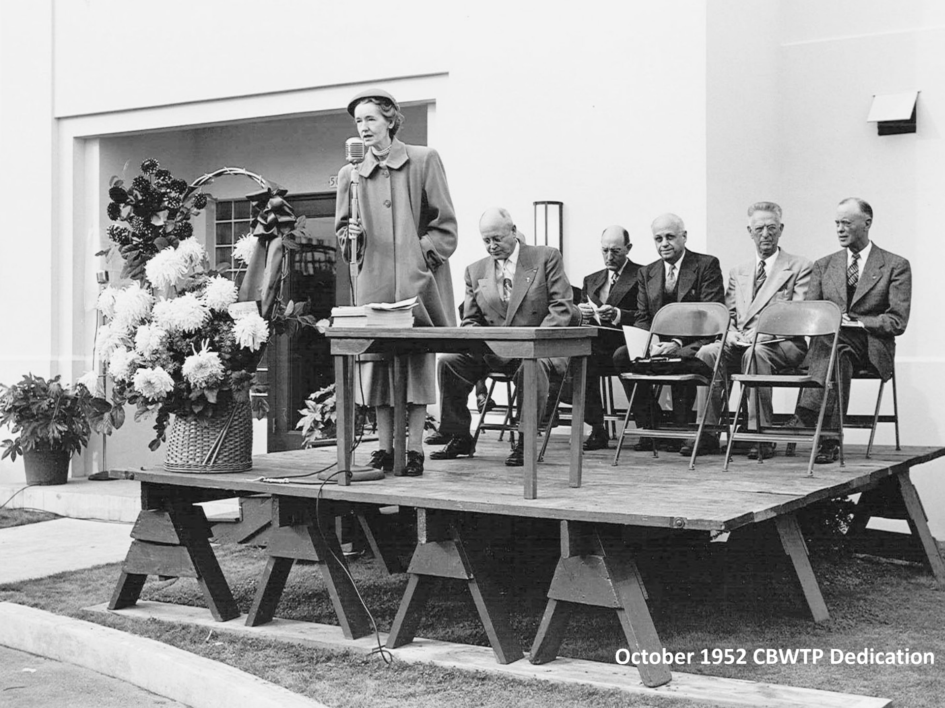
October 1952 CBWTP Dedication