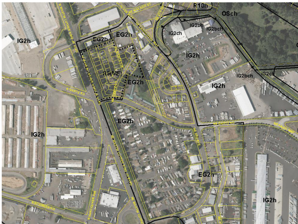
Deltawood residential area and manufactured home park near NE Gertz Rd.