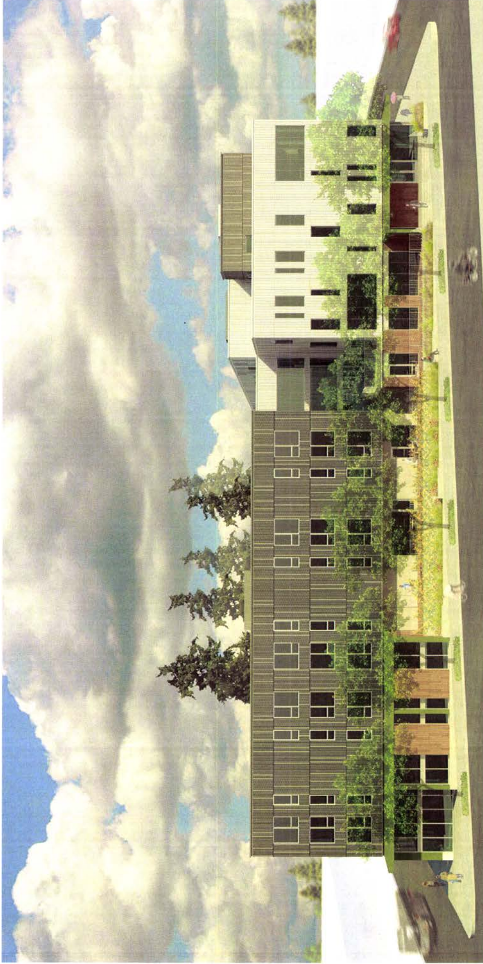
RENDERING - STARK STREET

ST. FRANCIS PARK APARTMENTS 1136 SE STARK STREET, PORTLAND OREGON DESIGN REVIEW APPLICATION 07/24/15