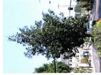
FOREST GREEN OAK