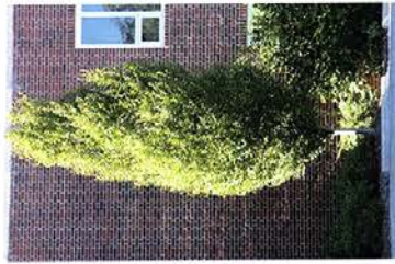
PYRAMIDAL EUROPEAN HORNBEAM