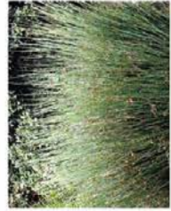
CALIFORNIA GRAY RUSH