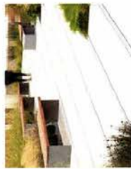
CONCRETE PAVERS/WOOD BENCH