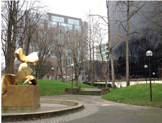
CONNECT & CREATE PARKS