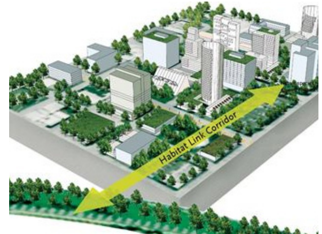
GROW AND BUILD GREEN