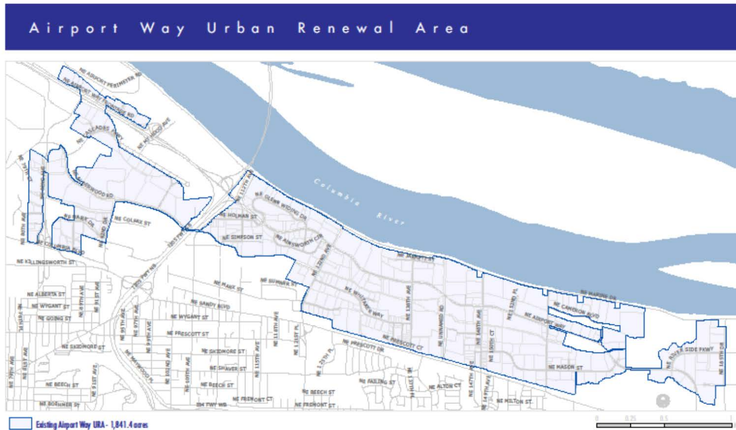
Figure 1 - Existing Area