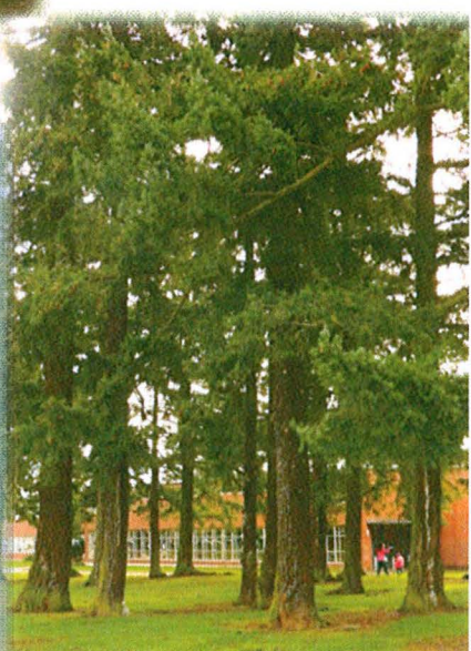
Trees provide shelter from the rain. Lots of butts!