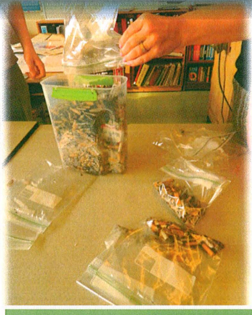
Final count within 25 minutes!