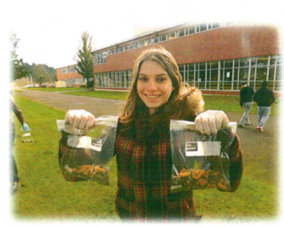
Rebel member with the loot.