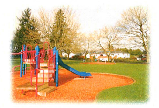
No butts at the play structures.