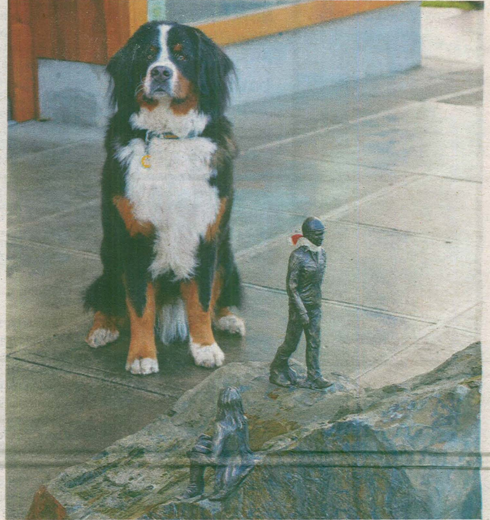
Chester and the little people at 26th & SE Division Street

Joe Walsh testified that disconnection will leave the reservoirs vulnerable