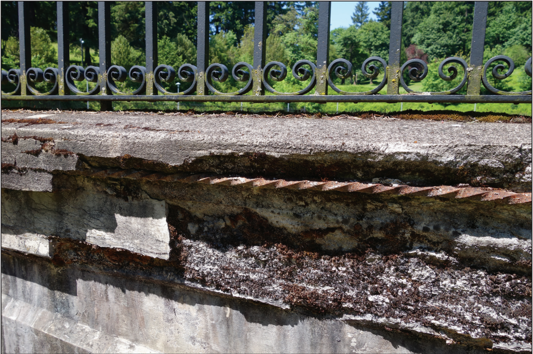
Reservoir 1 Exposed and Rusting Rebar Speeds Decay of the Concrete Walls