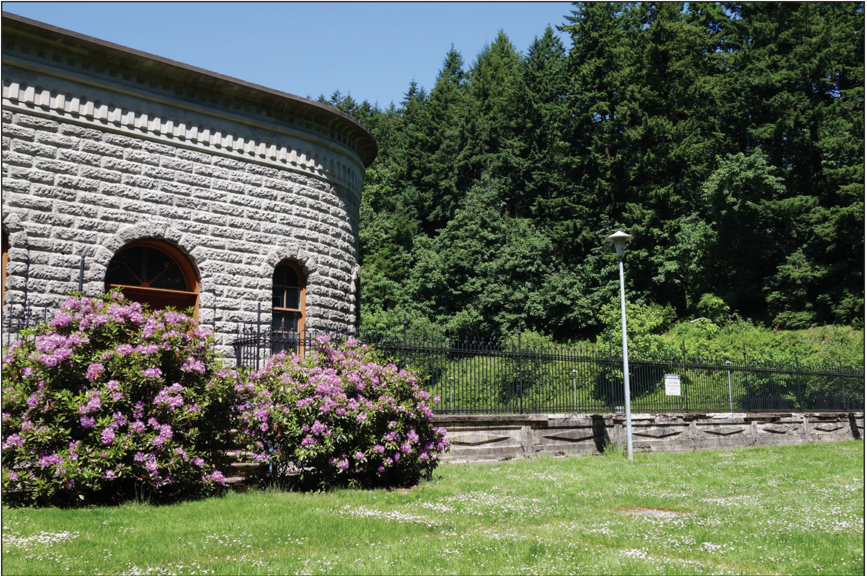
Reservoir 1 Restored Gatehouse, Crumbling Reservoir Walls