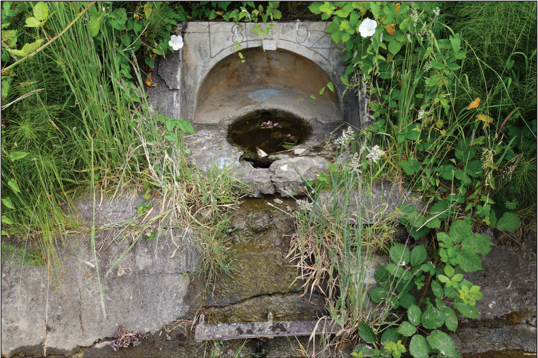
Public Drinking Fountain at Reservoir 1 Beautiful Design, 1894 Unconscionable State of Disrepair, 2014