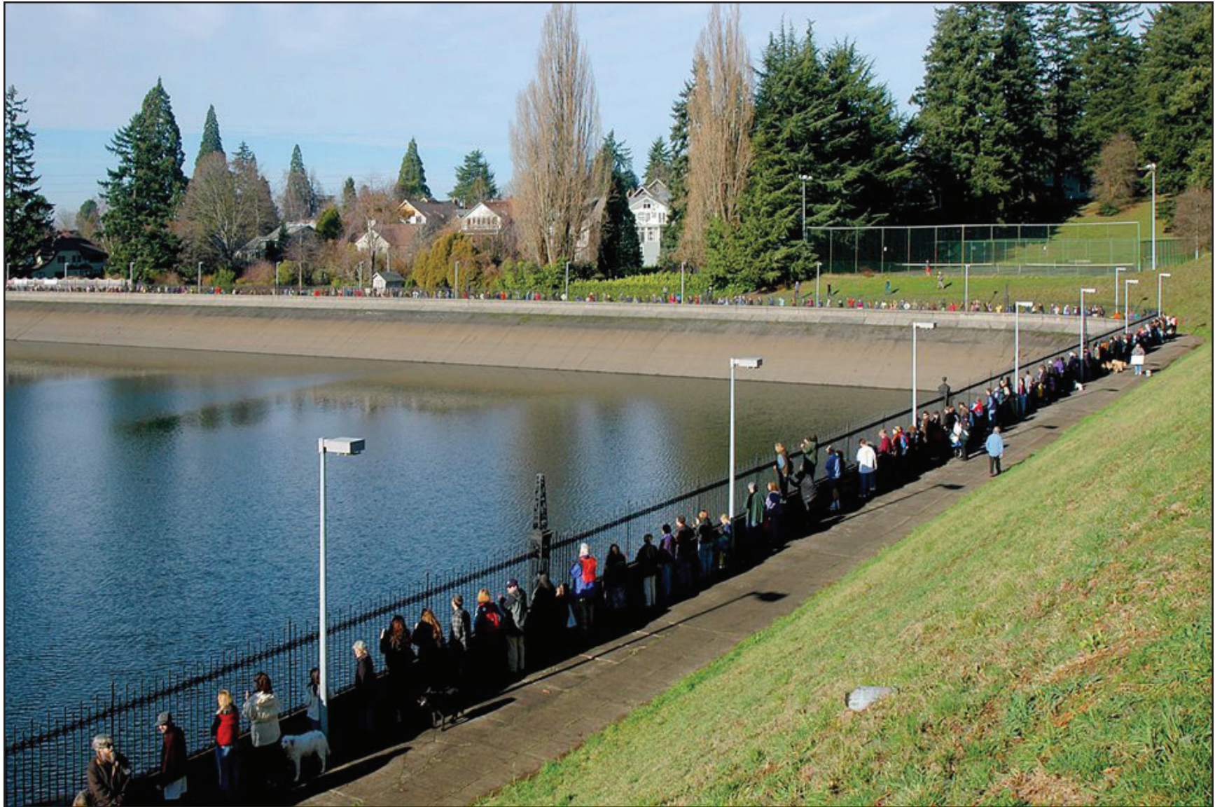
Hands Around the Reservoirs, 2003 A Thousand Portlanders Turn Out to Show Support for Their Historic Reservoirs Reservoir 6, Sunday, September 28th, 2003