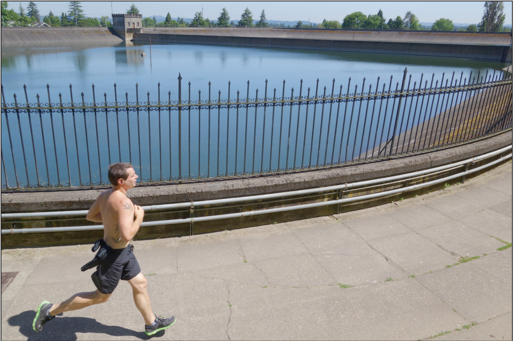
Reservoir 6 is Popular with Walkers and Joggers