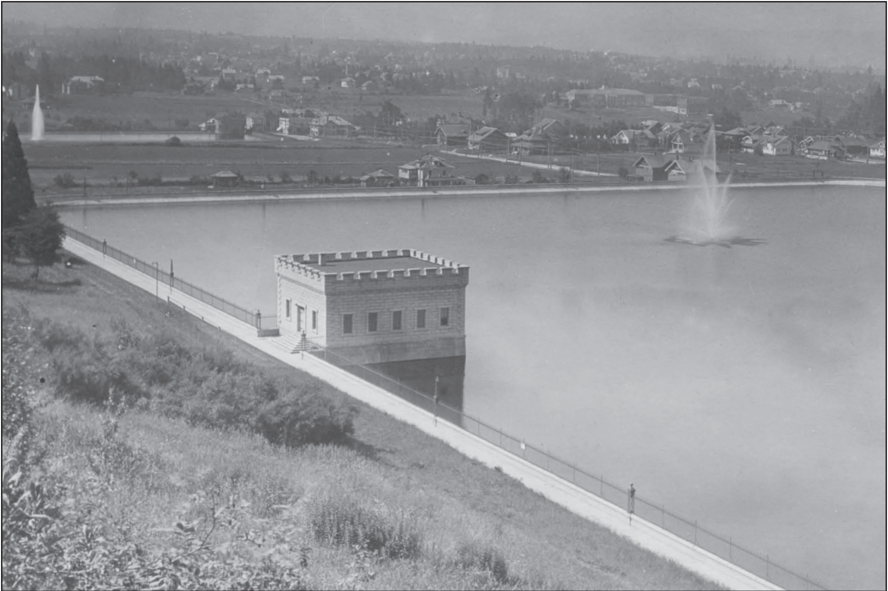
Reservoirs 6 and 2, July 1916. Reservoir 2, in the Background, Was Sold Off for Private Development in the 1980s.