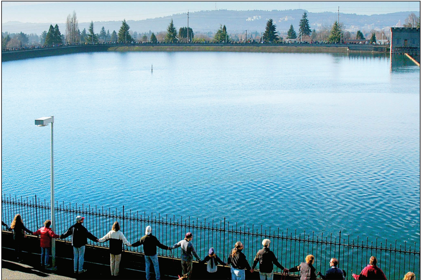
A Decade Later: Hands Around the Reservoirs, 2012 Portlanders Again Rally in Support of Their Historic Reservoirs Reservoir 6, Sunday, October 28th, 2012