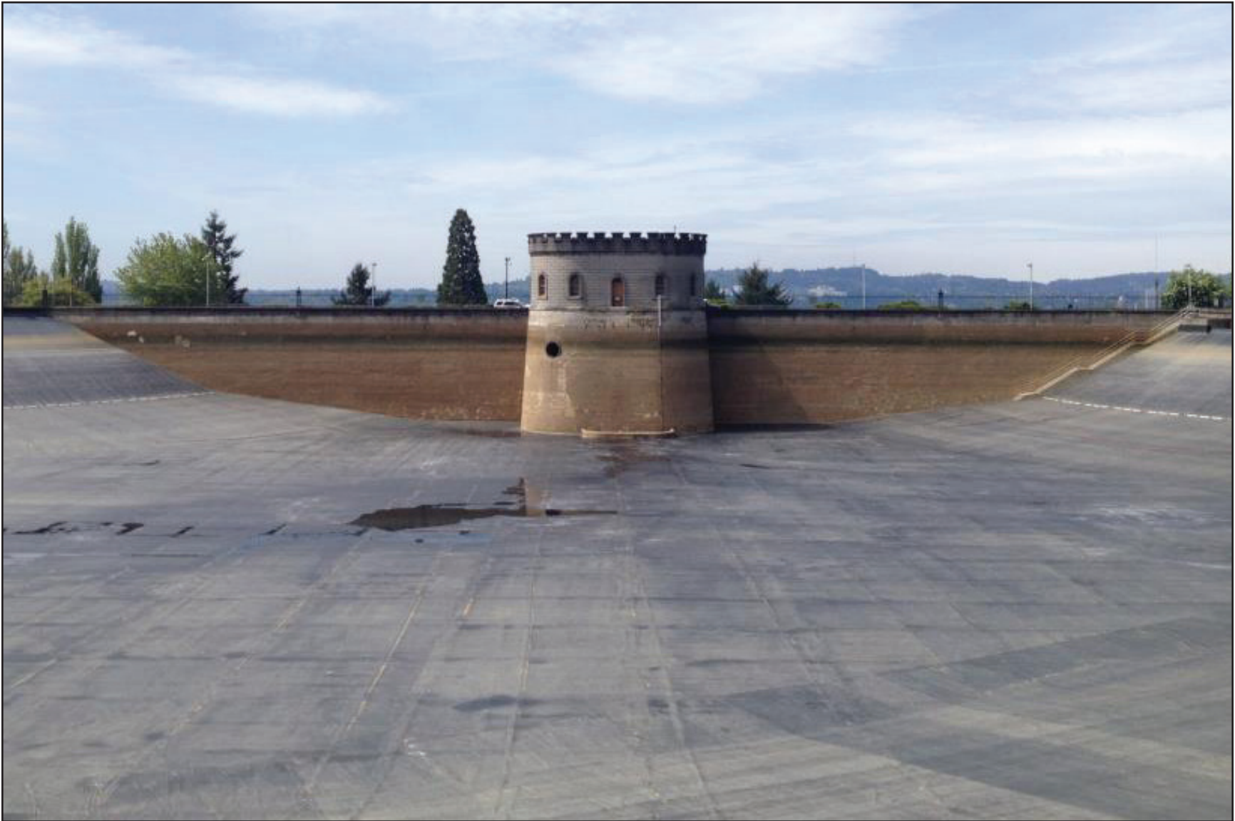
Reservoir 5 Water? Or No Water?