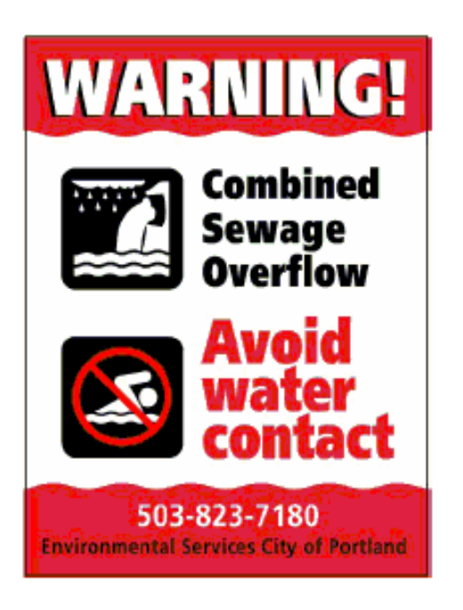
Columbia Slough extreme rain event warning sign

The Columbia Slough extreme rain event warning signs display the phone number of the Spill Prevention/Citizen Response Section. Staff monitors the line 24 hours a day. The Willamette River warning signs display the phone number of the River Alert Hotline, a 24-hour recorded message the public can call to learn if a CSO advisory is in effect and to hear a message about the CSO program.