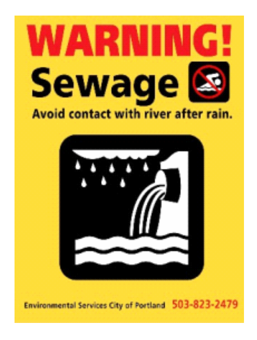
Willamette River CSO warning sign

The River Alert system also includes ten folding signs installed at public access points to the Willamette River. A contractor travels the river by boat and opens the warning signs each time there is a CSO between May 15 and October 15. Forty-eight hours after each CSO event ends, the contractor closes the warning signs. The contractor is required to supply BES with written verification that the signs were opened or closed and a report of the times the work was completed. In the rainy season between October 15 and May 15, the signs remain open with the message in view for boaters and other river users.