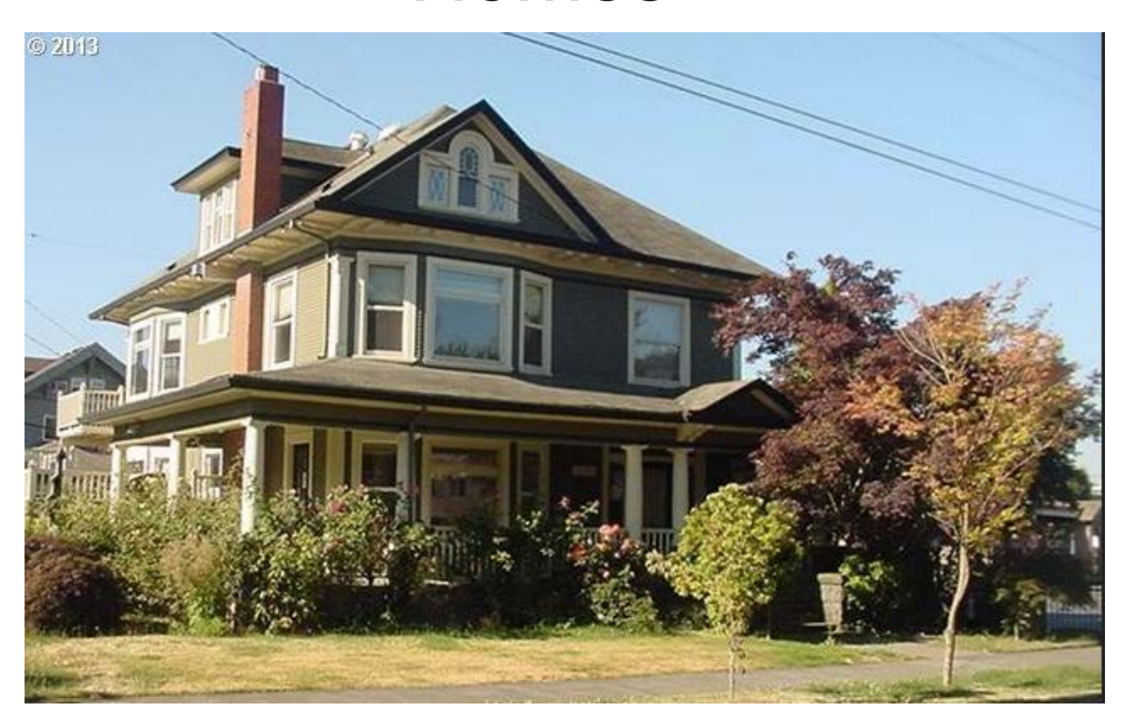
Portland, OR Triplex