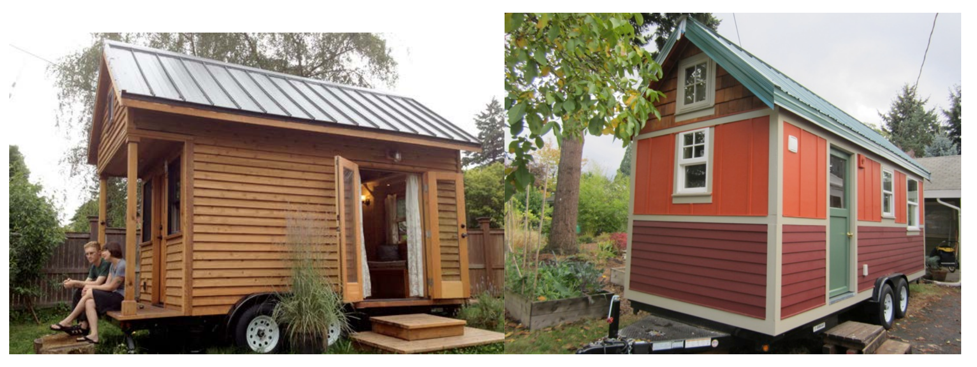
Built by Portland Alternative Dwellings