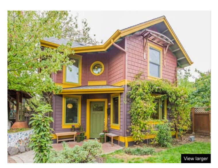
Sabin Green ADU (Orange Splot LLC)