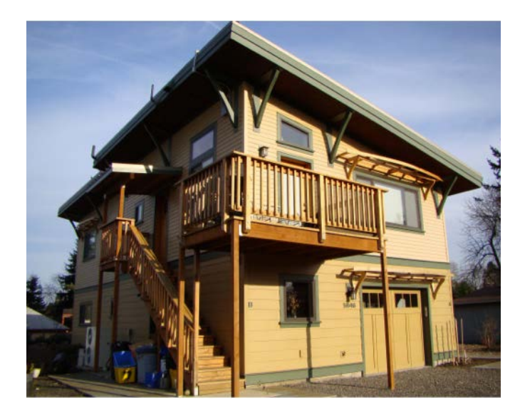
Granger House internal ADU