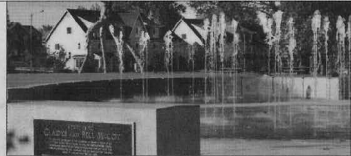
McCoy Park in North Portland is surrounded by multifamily buildings.

But with older parks the story is quite different. Using the recently released Comprehensive Plan's map app, I did a quick review of zoning along the perimeters of all 24 parks with playgrounds in Northeast Portland and found that the average park in this group is a little over 70 percent surrounded by sin-