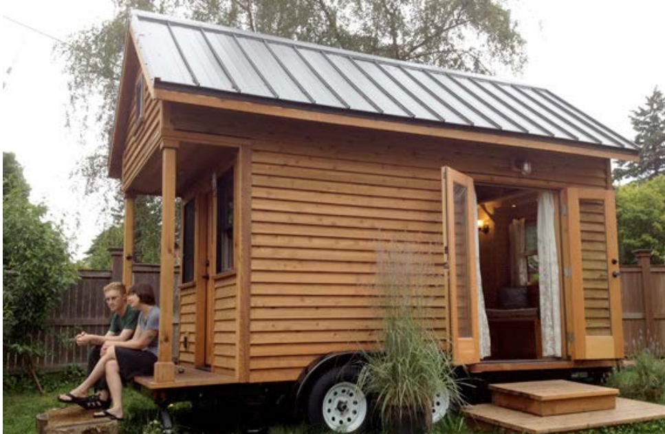
Built by Portland Alternative Dwellings