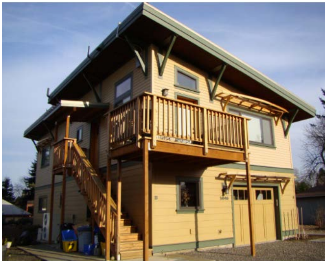
Granger House internal ADU