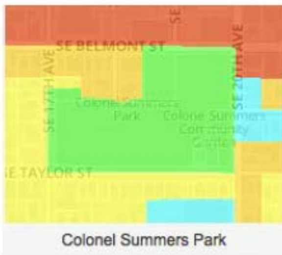
Colonel Summers Park