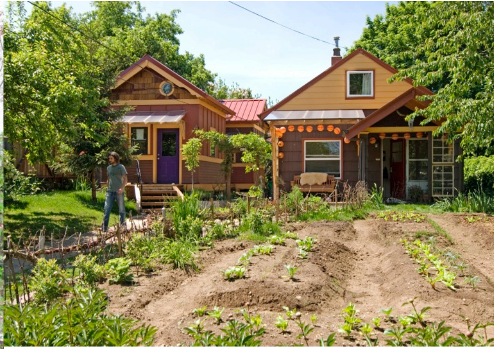
Ruth's Cottages (Orange Splot LLC)