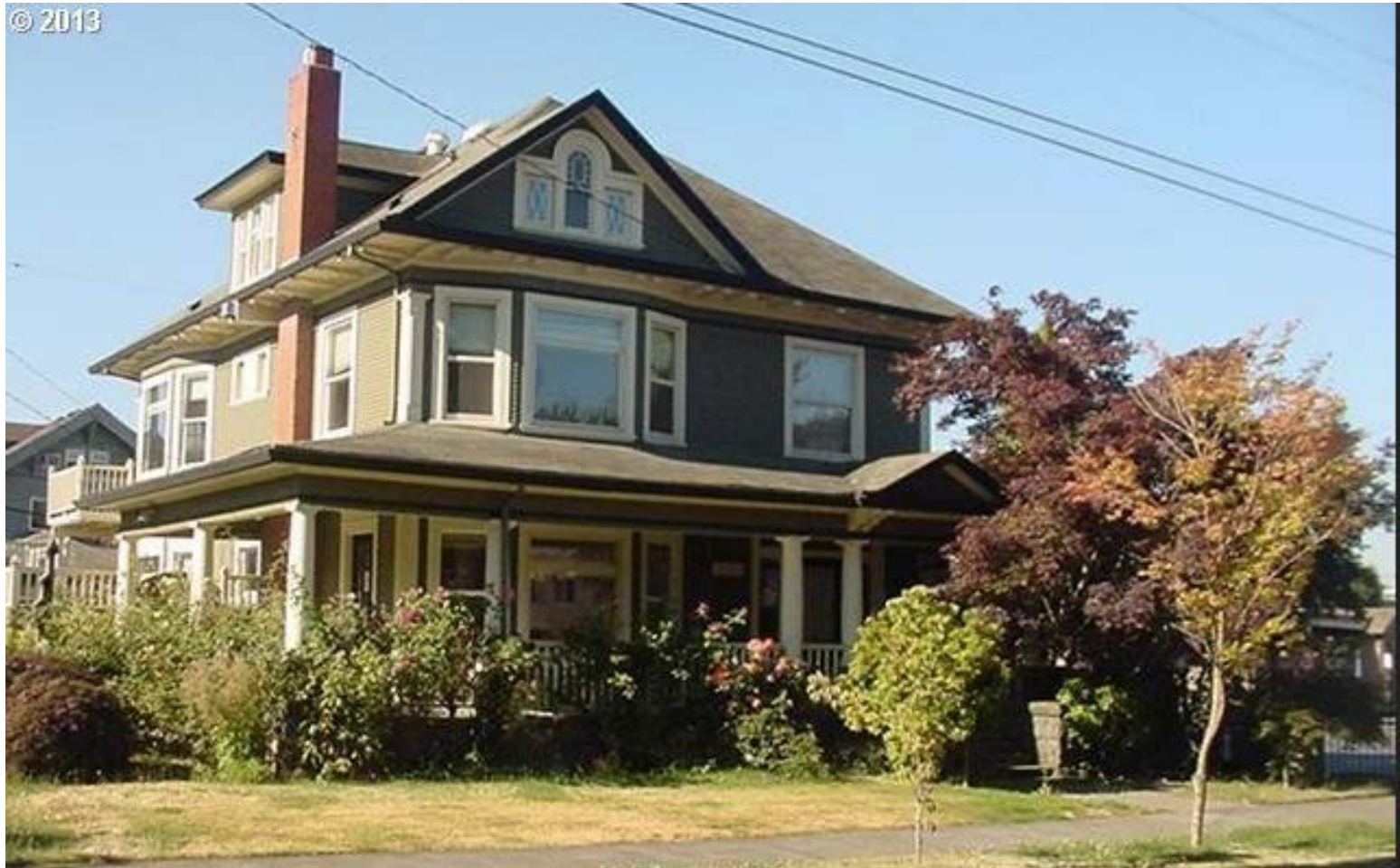
Portland, OR Triplex