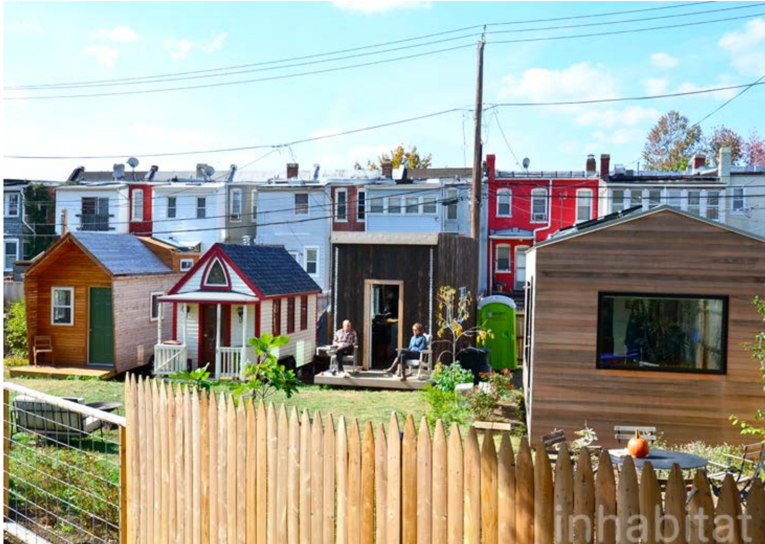
Boneyard Collective in Washington, DC (various builders)