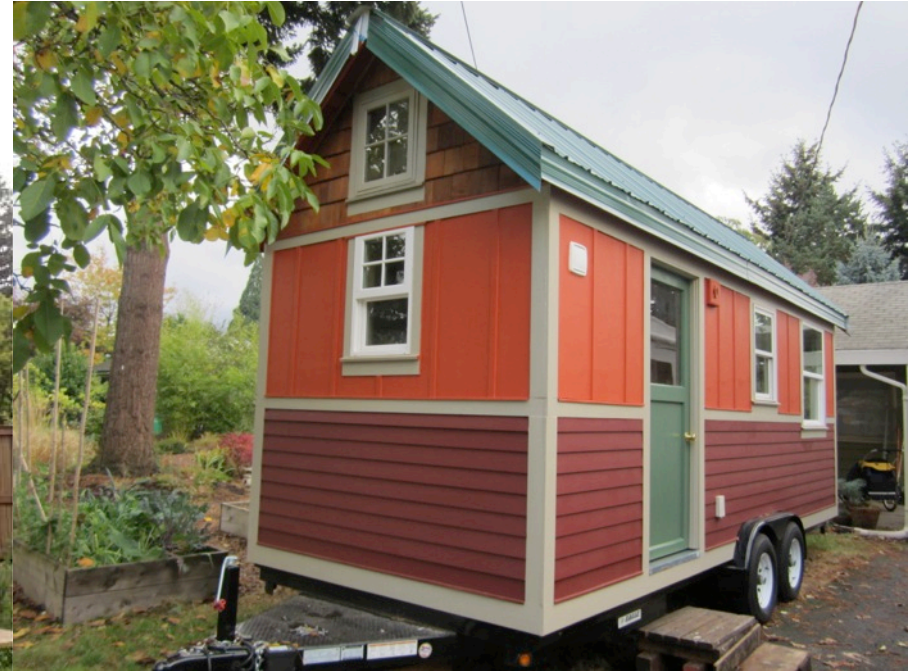
Built by Orange Splot LLC