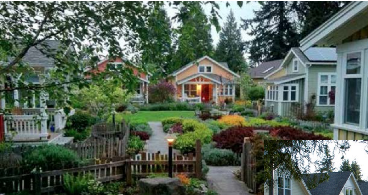
Greenwood Avenue Cottages (Ross Chapin)