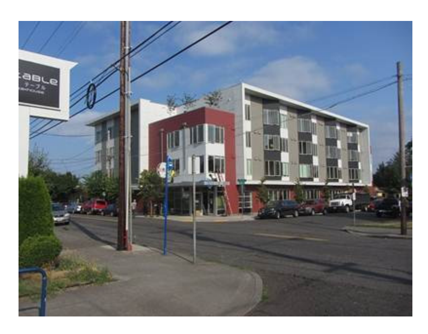
The <u>Town Center</u> characteristics are building east of there: