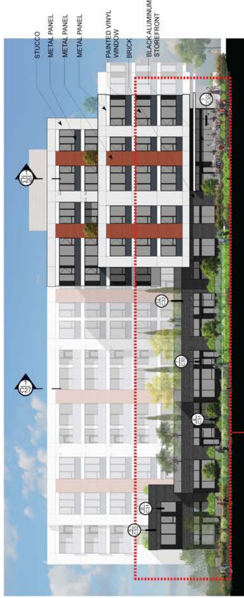
2 EAST ELEVATION