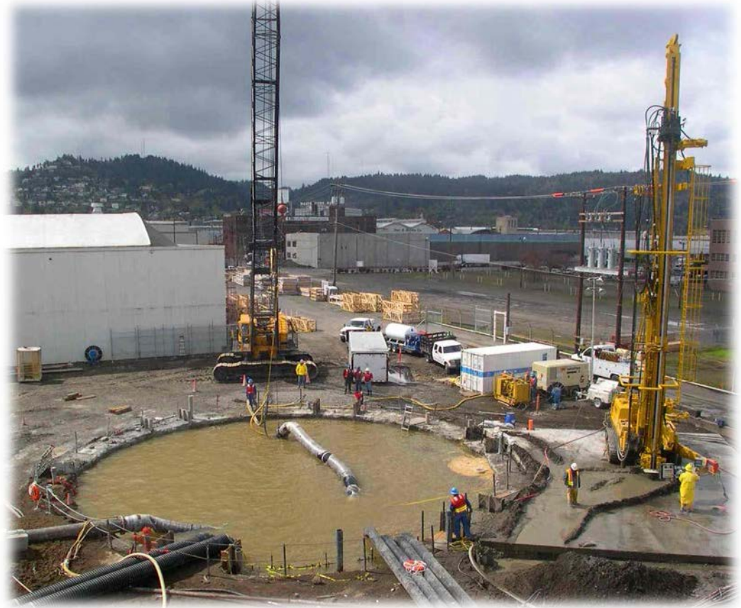
Nicolai tunnel shaft construction for the West Side Big Pipe at Terminal 1