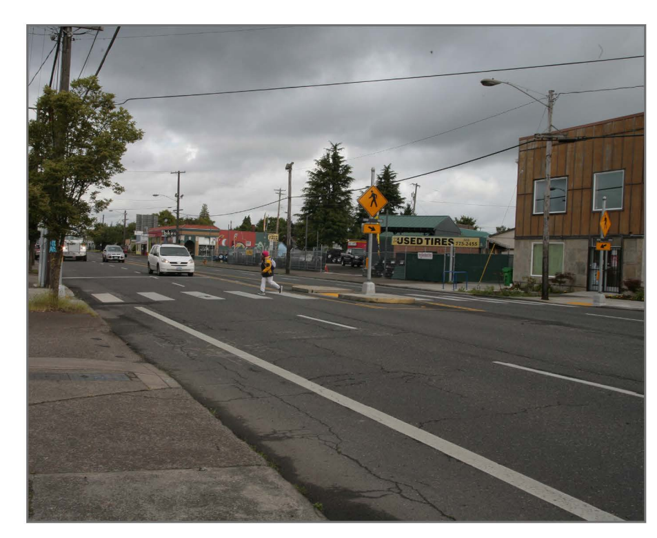
New rectangular rapid flashing beacons (RRFB) improve safety and comfort for people crossing Foster Road.

Over the last two years, the City completed a multi-bureau effort called the Foster Lents Integration Partnership (FLIP), which developed a strategic roadmap for this corridor. The FLIP process resulted in an integrated work program, including short- and long-term actions, for City Bureaus and the local community. Improving the transportation function of Foster Road was identified as a top priority.