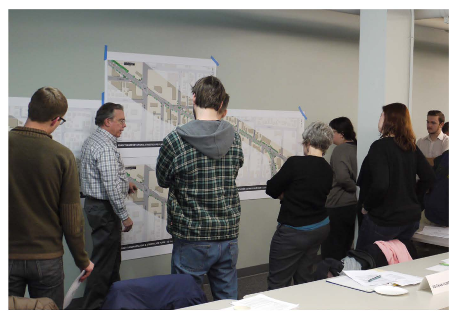
A PBOT engineer presents the plan view concept design and addresses committee member questions.