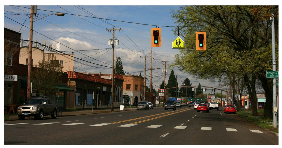
Foster Road has a typical four lane cross section with two travel lanes in each direction, on-street parking and commercial mixed use zoning in the Heart of Foster.

Prevalence of skewed intersections. Because Foster Road bisects the street grid diagonally from northwest to southeast, nearly all 42 intersections within the project area are skewed. Only SE Rhone Street, SE 60th Avenue and SE 80th Avenue are aligned perpendicular to Foster Road. This presents unique geometric and pedestrian design challenges at each location, and it increases block lengths, sometimes up to almost 500 ft long.