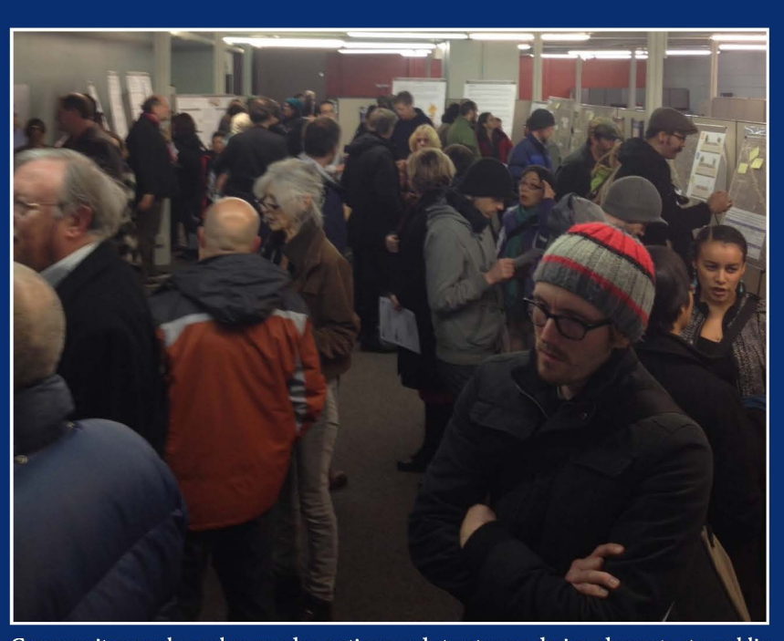
Community members observe plan options and streetscape design elements at a public open house.