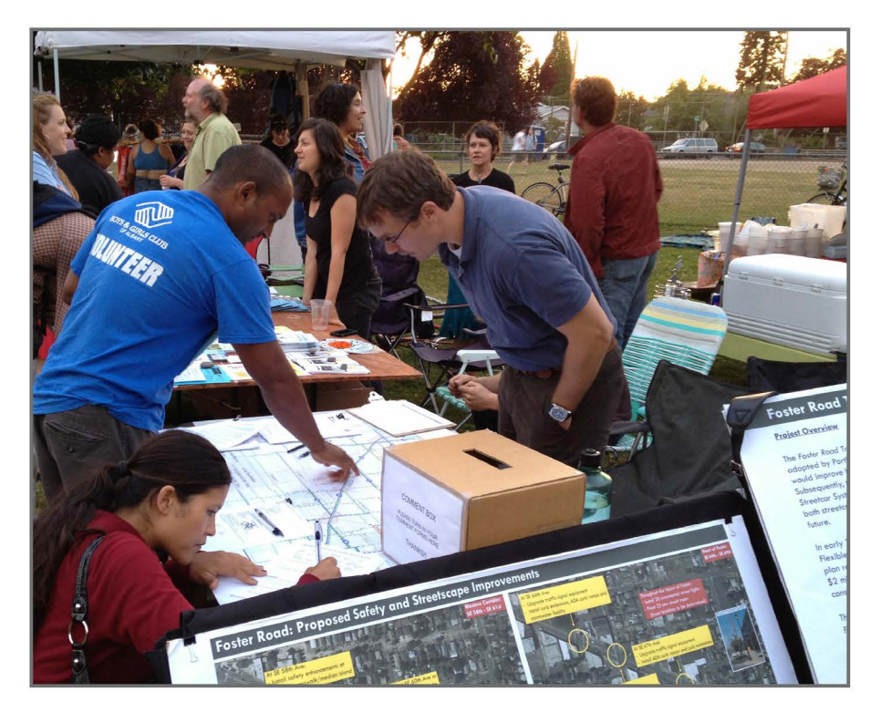
PBOT staff engages the community at the 2013 National Night Out event at Kern Park.