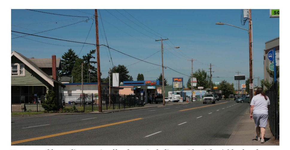
Foster Road has a diverse mix of land uses including residential neighborhoods fronting the street.