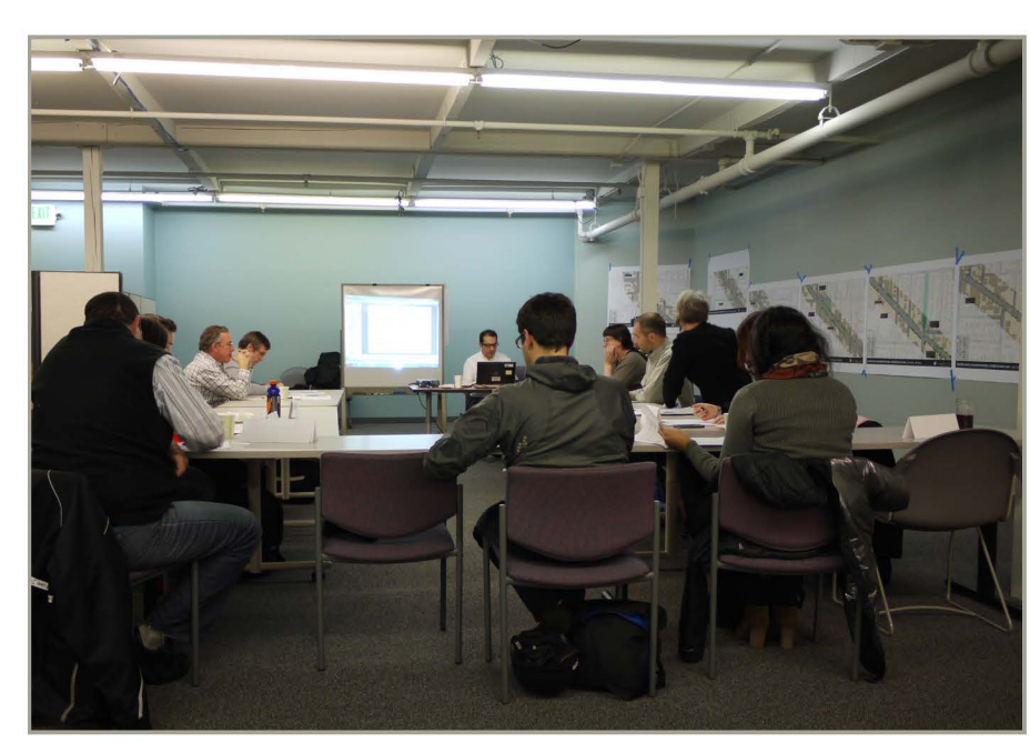
Stakeholder Advisory Committee members review the draft cross sections and plan view concept design.