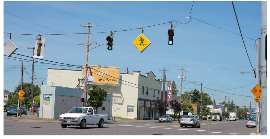
Foster Road has many skewed intersections.