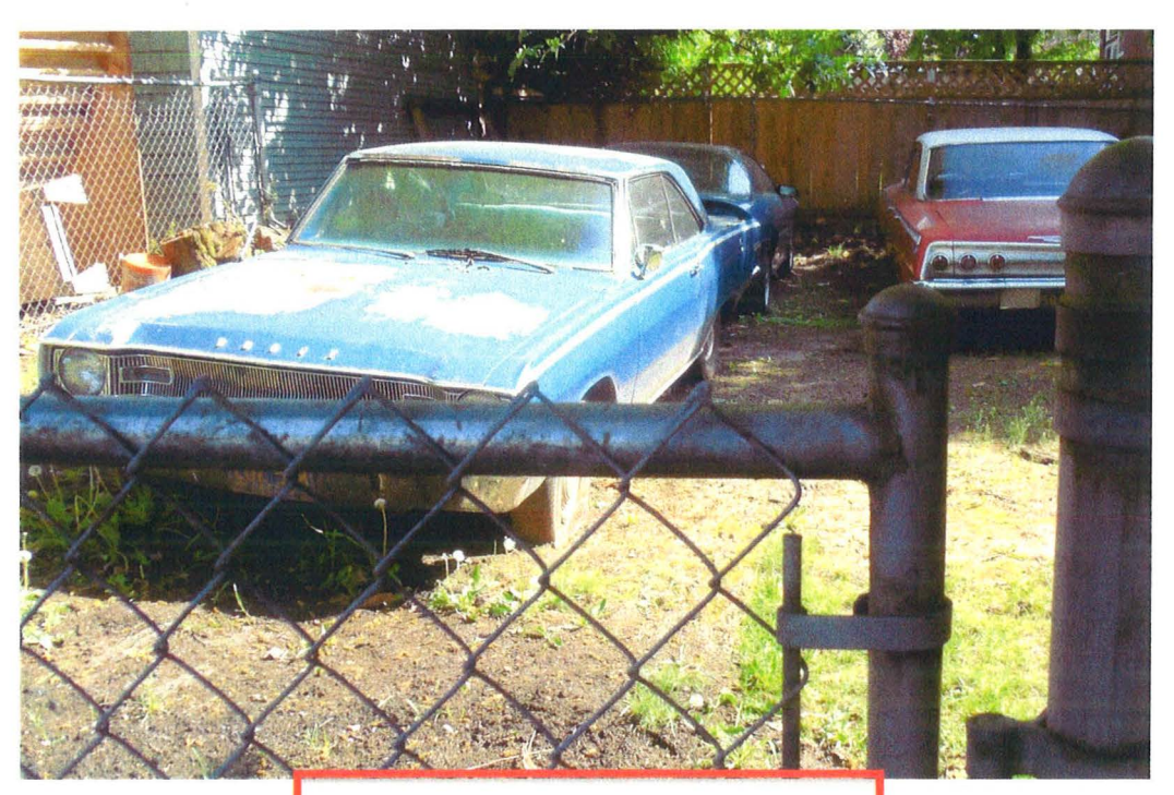
5432 NE 18th Ave., Portland

At 6227 NE 19th Ave., Portland there are 2 vehicles with expired registrations off pavement not cited by C.O.P inspectors