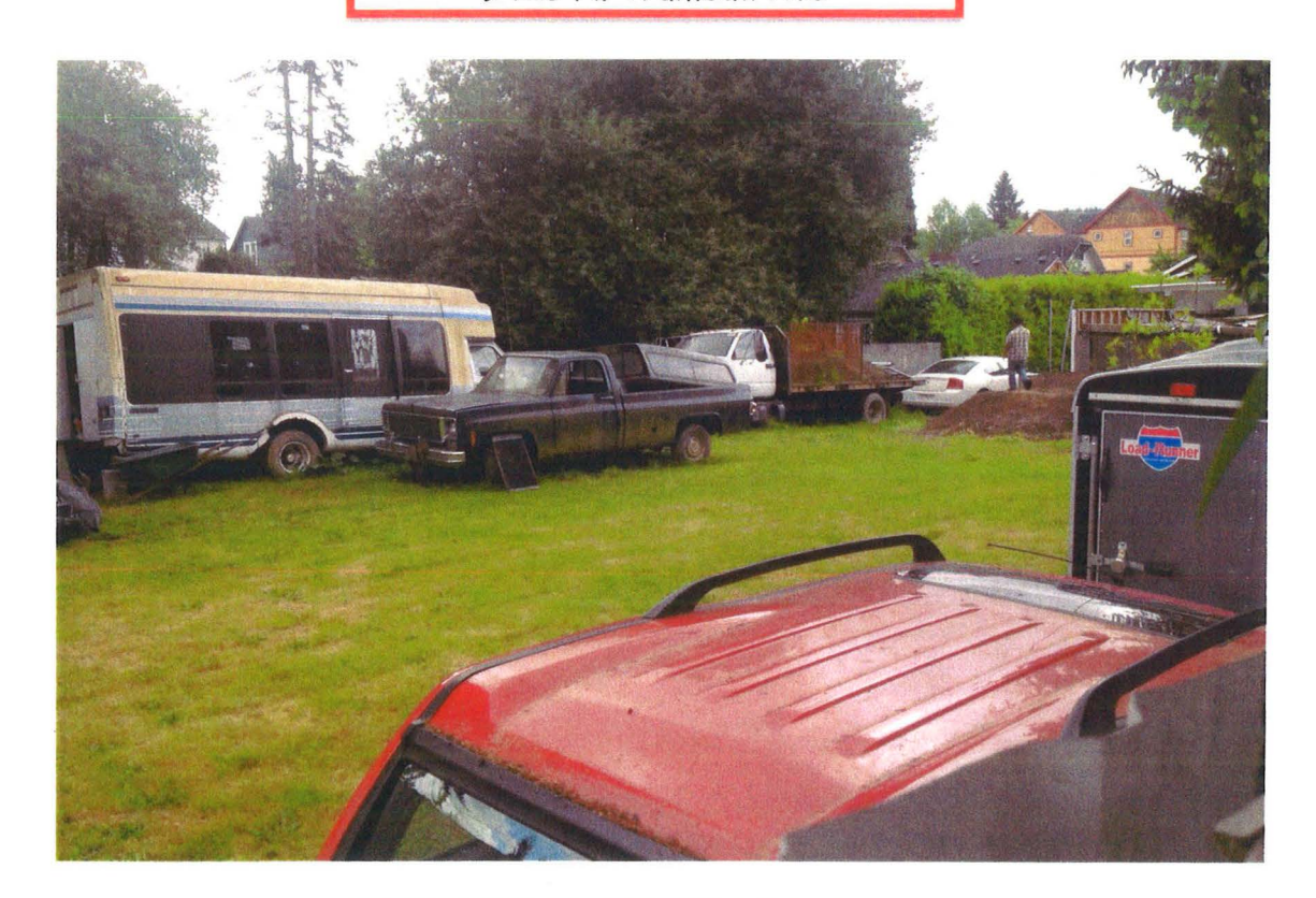
9223 N. Seneca St.