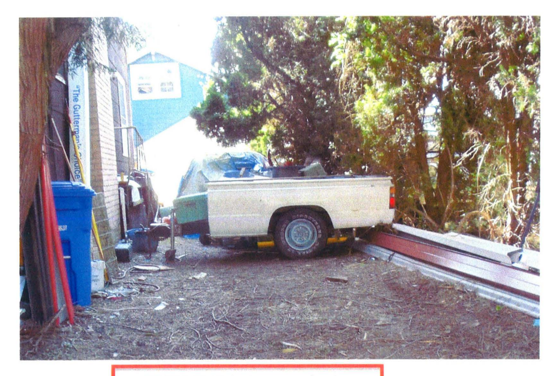
5565 NE 18th Ave., Portland