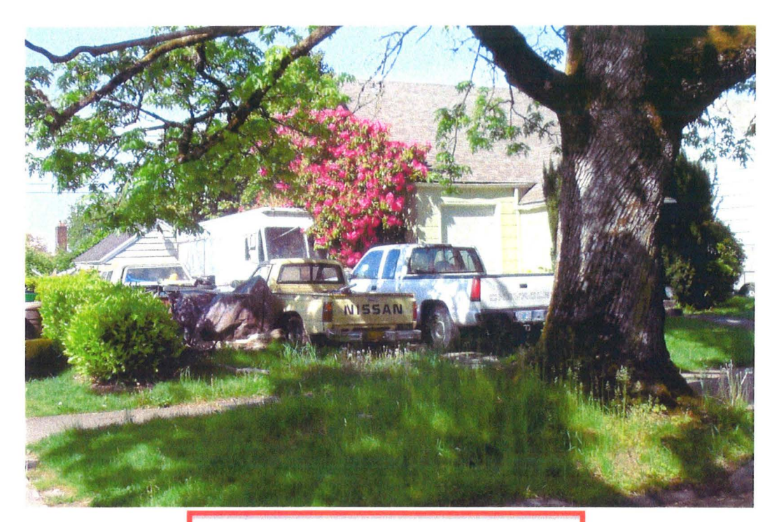
1915 NE Ainsworth Blvd., Portland