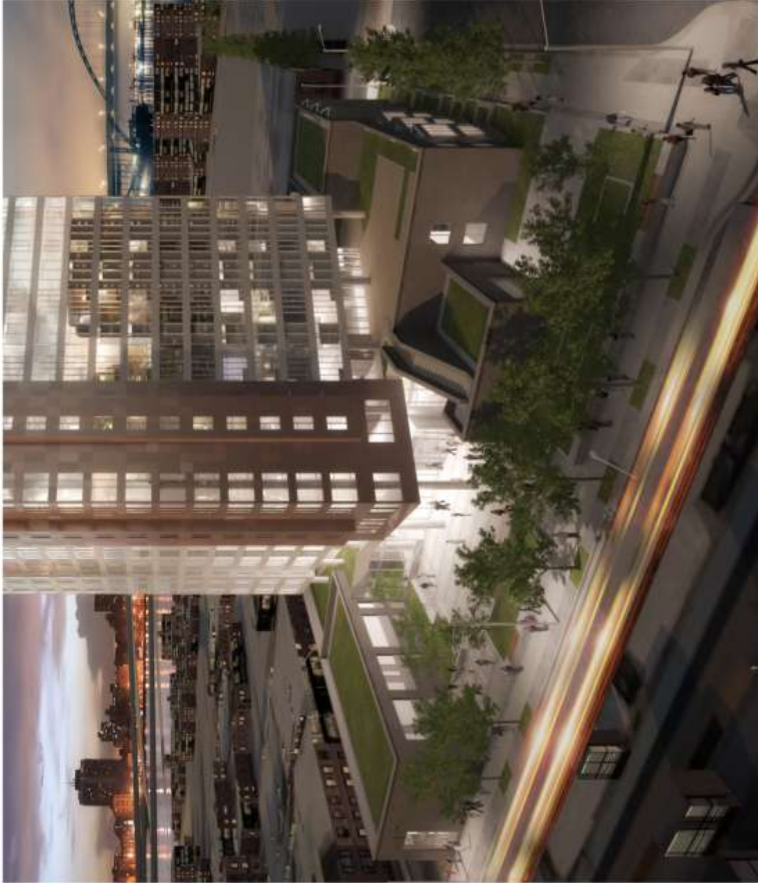
VIEW FROM SOUTHEAST PERSPECTIVE VIEWS