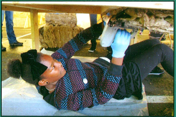
A middle school girl tries installing insulation in a workshop with Balanced Energy Solutions