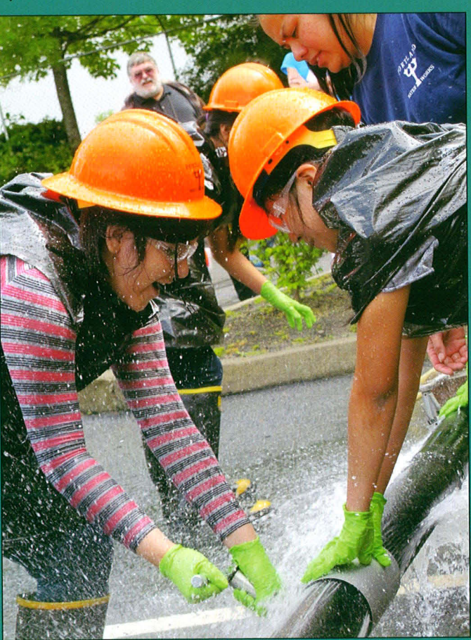
High school girls fix a water main break in the Portland Water Bureau's workshop

OTI extends immense gratitude to the businesses, organizations, and individuals who support the work of OTI through participation in the annual Women in Trades Career Fair, and who support our mission throughout the year to inspire girls and women in their exploration of career pathways in the trades as viable and gratifying options for their futures.