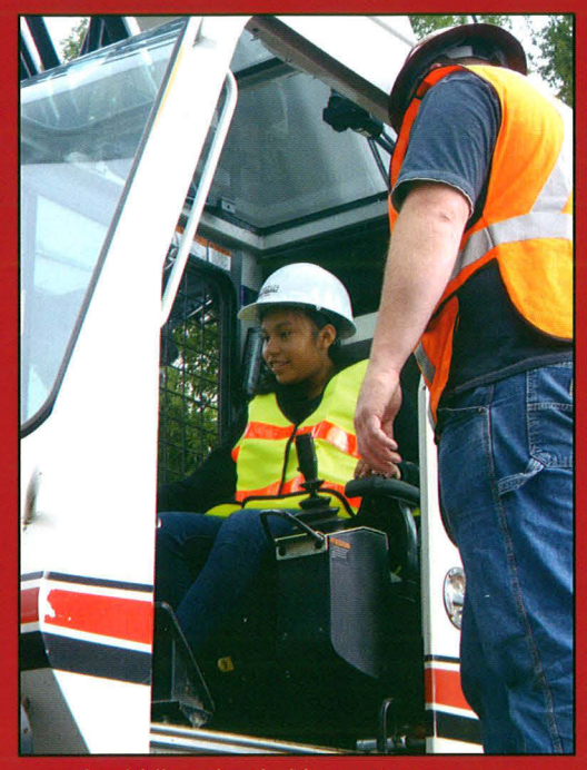
A middle school girl operates a crane in a workshop with Interstate Crane