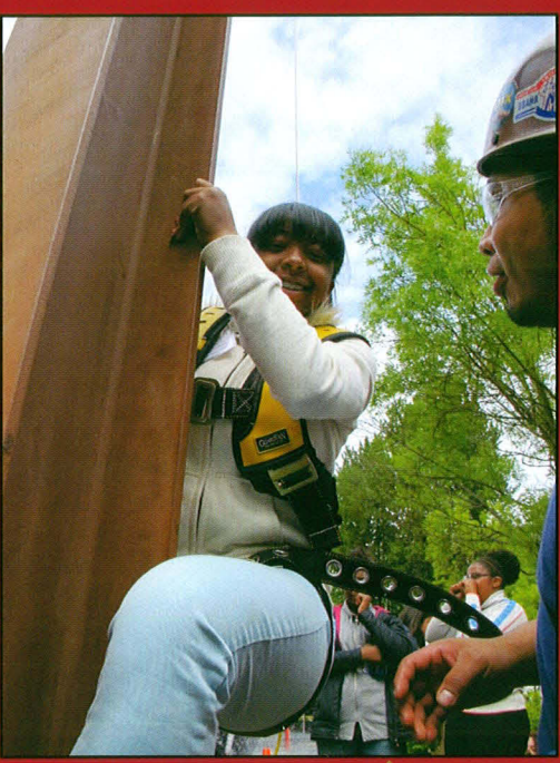
A high school girl climbs a beam in a workshop with the Pacific Northwest Ironworkers Local 29