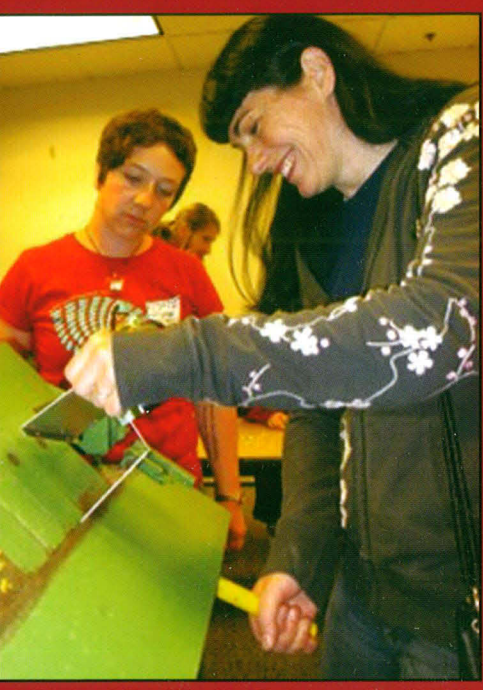
A Careers For Women Day attendee learns to bend sheet metal in a workshop with the Sheet Metal Institute