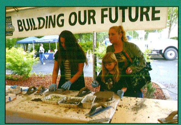
Careers for Women Day attendees learn how to make concrete stepping stones in a workshop with the Cement Masons Local 555