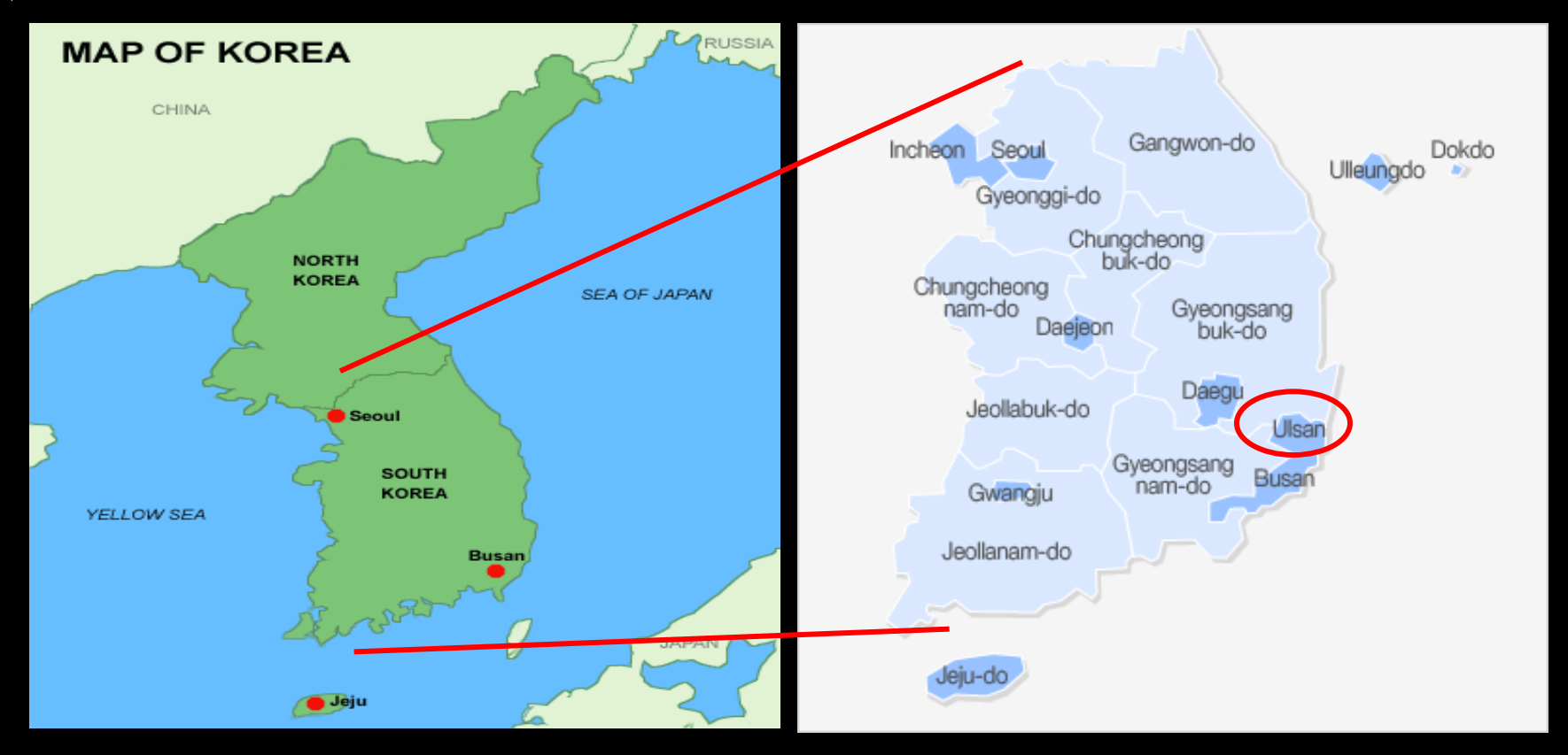
Ulsan - population: 1.2 million