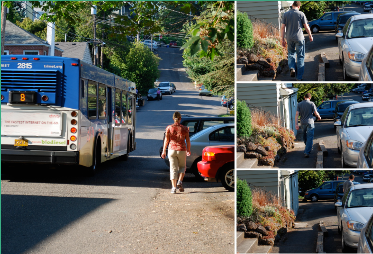
Head-in parking makes it impossible to walk between the parked cars and buildings along much of SW 11th. Enforcing parallel to the curb parking could allow space for an improvised sidewalk at no cost to the city. Left: the frequent service line 8 bus speeds by a pedestrian. Right, a person walks in an improvised sidewalk at Gibbs and 11th, but crosses into the traffic lane because a van parked head-in and blocked his way.