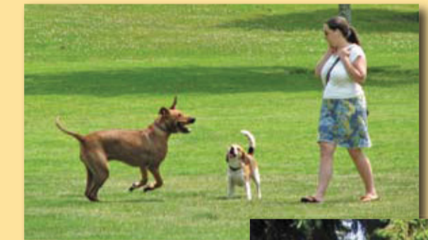
Dog off-leash areas

The working budget estimate for this group of improvements (6 sites) is $160,000 - $200,000