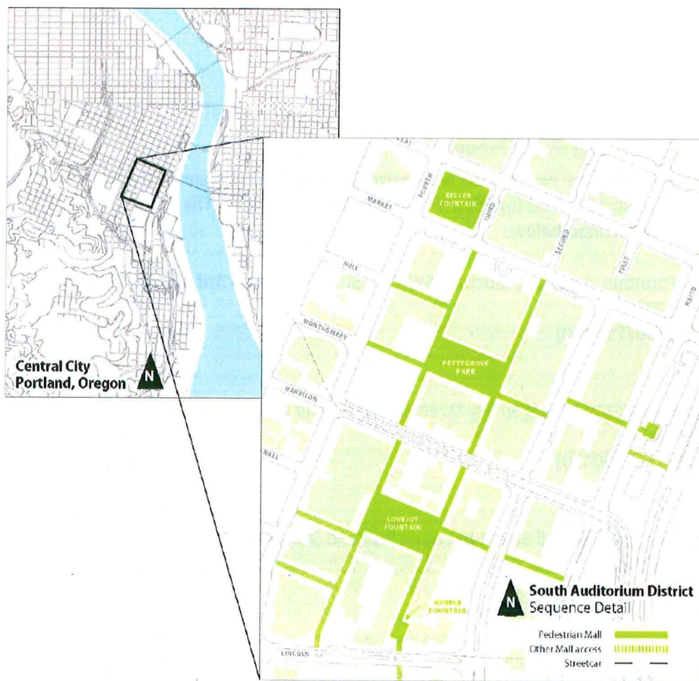
The Halprin Open Space Sequence - Site Map