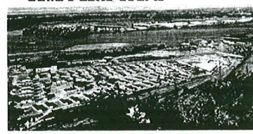
Guild's Lake Courts