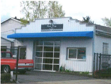
Expanded storefront improvement program for businesses ($115,000)