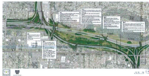
Planning “Gateway Green” (I-205/I-84) development of public space ($45,000)