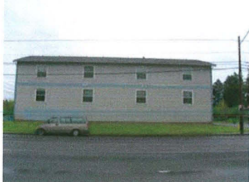
Planning for 122 nd Ave. to create a more convenient, walkable neighborhood ($30,000)