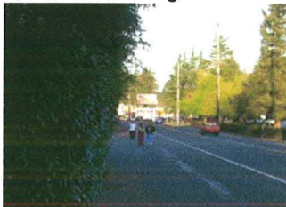
$50,000 initiated a Powell Blvd. Improvement planning project that was matched by a $330,000 ODOT grant