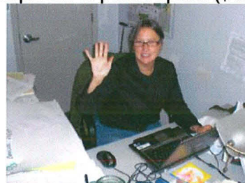
Hired an EPAP Advocate to support project implementation ($125,000)