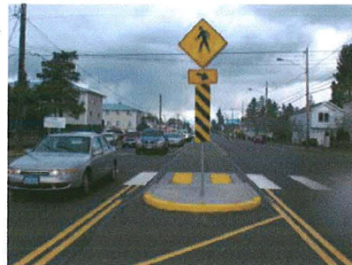
Implemented Safe Routes to School + Traffic Safety improvements ($60,000)