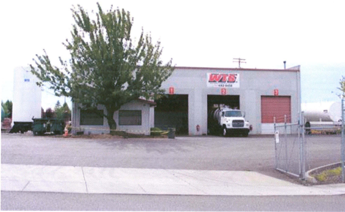
Above: View of WTS from its main gate on NE 89th. Below: A septic truck pumping out on the open lot. Note unpaved surface and outdoor tanks. Both photos were taken on 27 June 2011.