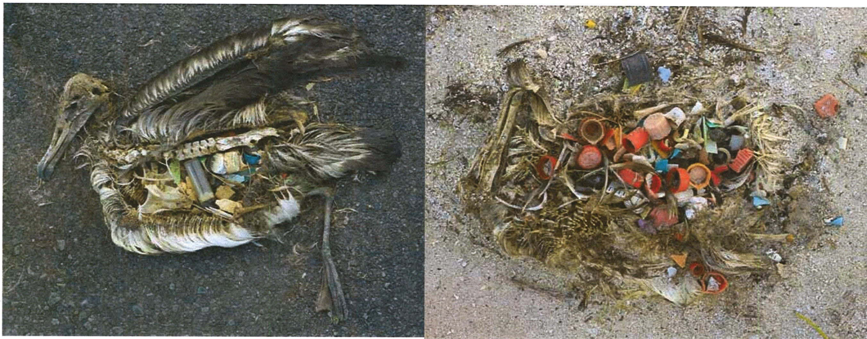
Albatrosses on Midway