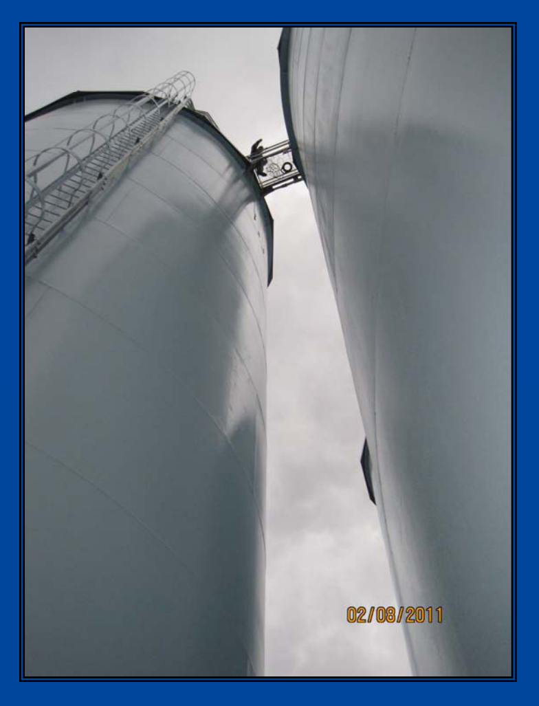
Condition of tanks markedly improved