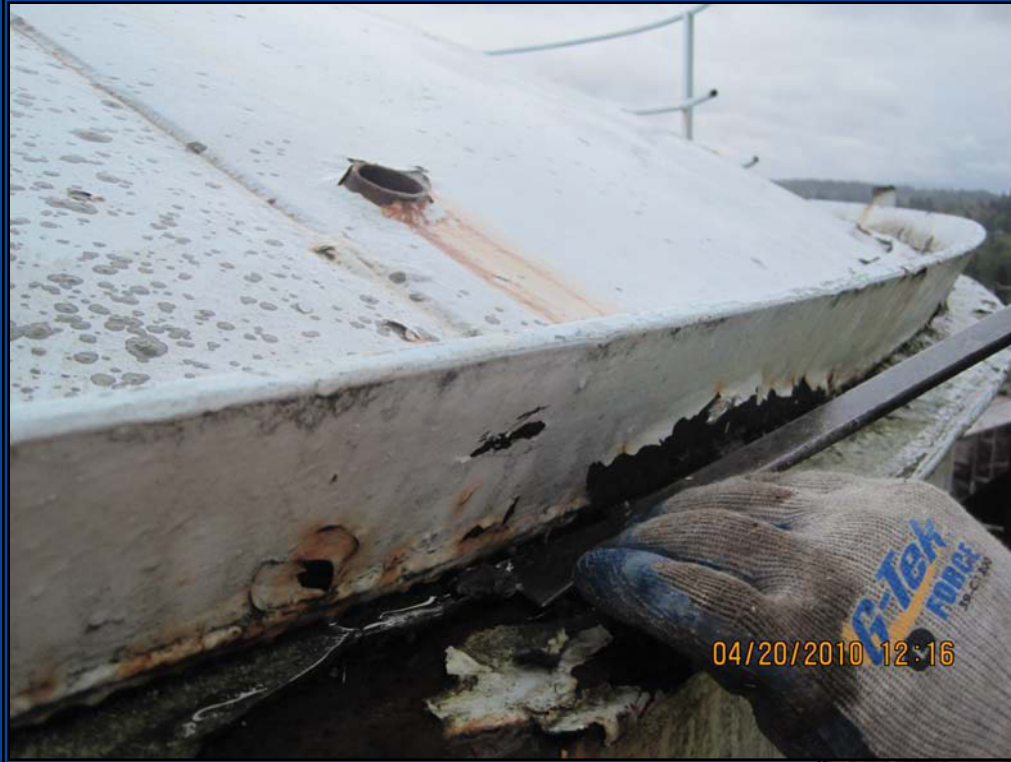
Steel at top connection unsound