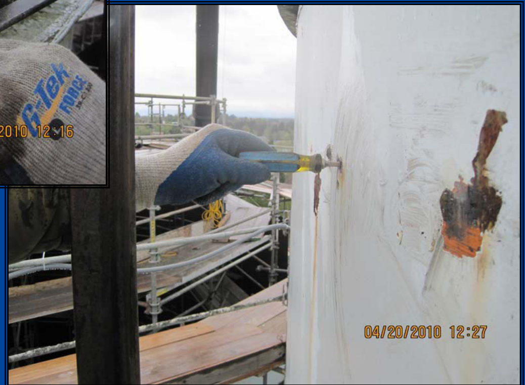
Hole in sidewall with screwdriver stuck through