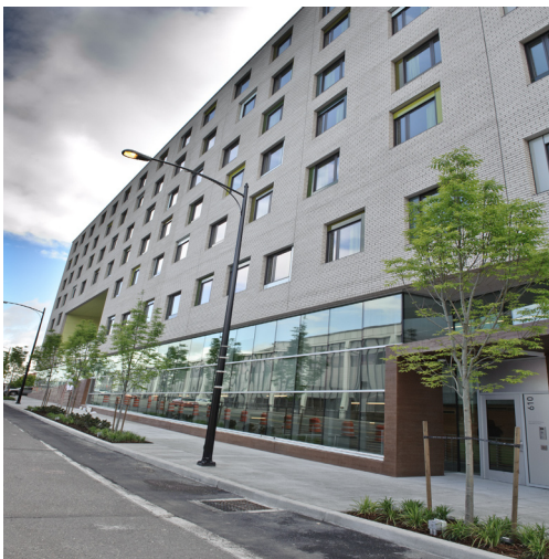
Bud Clark Commons

Move people quickly from homelessness into housing in a way that lasts.