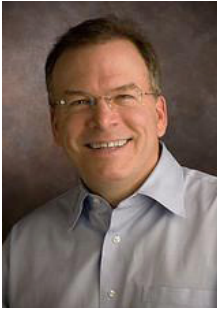
NICK FISH Housing Commissioner City of Portland

The Portland Housing Bureau is charged with making sure all residents have safe, stable homes. We are guided in our work by three core goals: ending homelessness, increasing the availability of rental housing, and promoting stable homeownership. We're focused on eliminating racial and cultural barriers to housing.