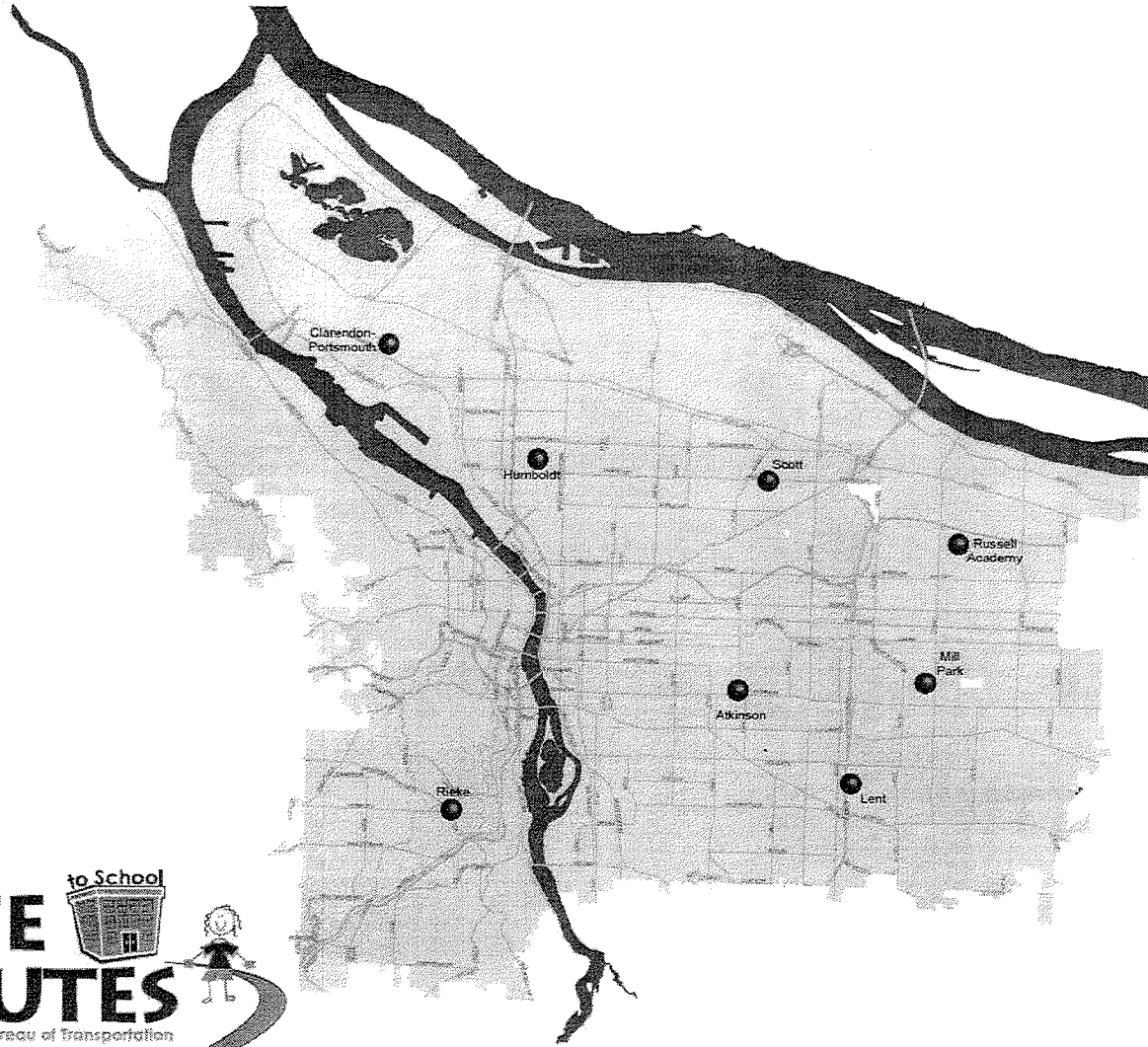
EXHIBIT A - Project Location Map to Agreement No. 26726