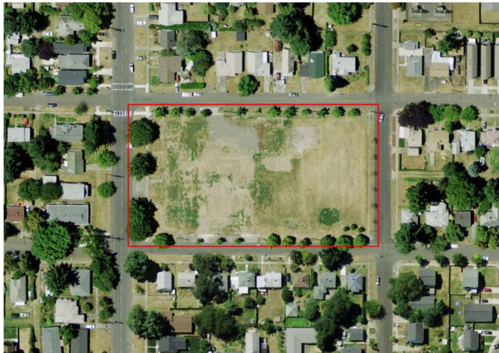
SITE AERIAL NOT TO SCALE