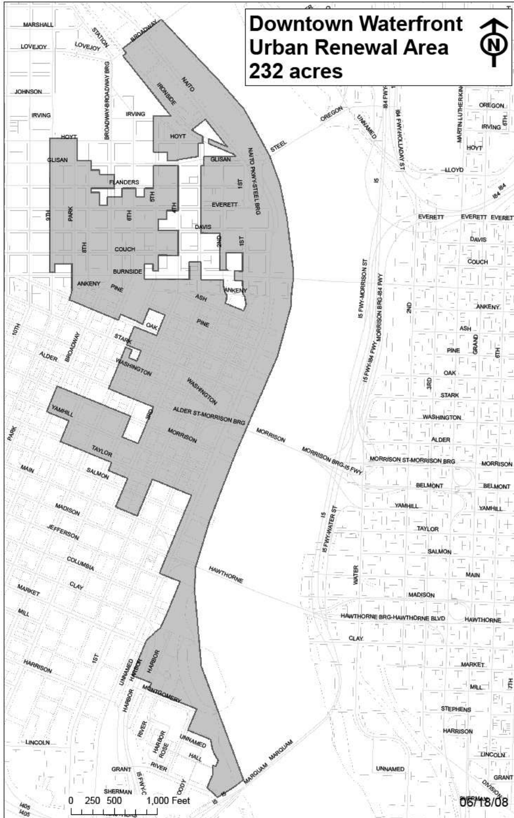
Exhibit One – Part Two. Downtown Waterfront Urban Renewal Area Boundary Map