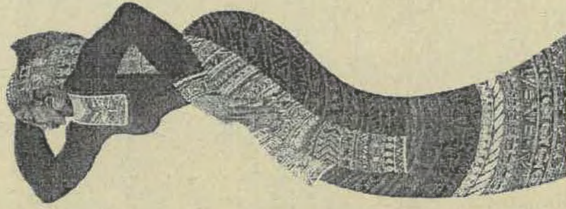
Lady in Black III Charles Bibbs

Travel arranged by: Custom Travel & Cruising Sponsored by: Regional Artist Market