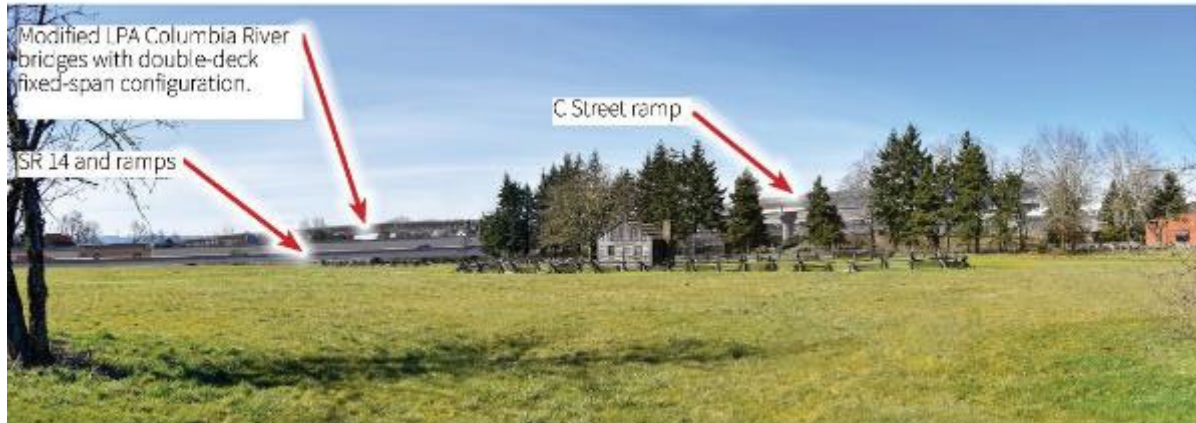
Photographic simulation of Modified LPA with double-deck fixed-span configuration with C Street Ramp