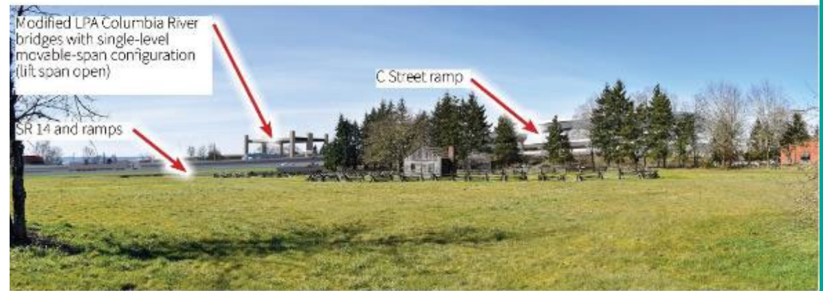
Photographic simulation of Modified LPA with single-level movable-span open configuration with C Street ramp