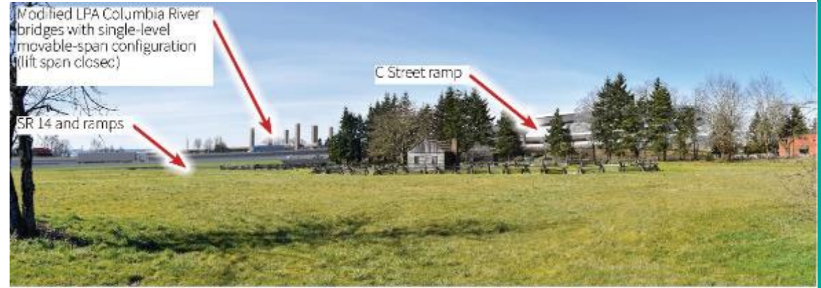
Photographic simulation of Modified LPA with single-level movable-span closed configuration with C Street ramp