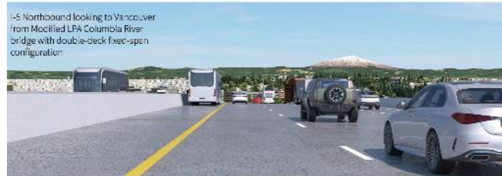
Photographic Simulation of the Modified LPA with double-deck fixed-span bridge configuration