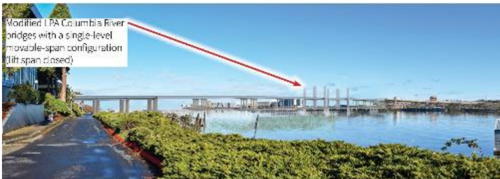
Photographic simulation of Modified LPA with single-level movable-span configuration