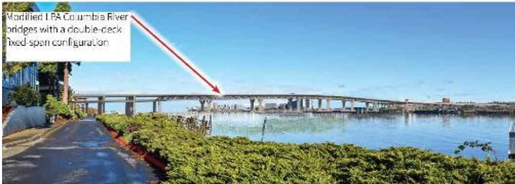
Photographic simulation of Modified LPA Columbia River bridges with a double-deck fixed-span configuration