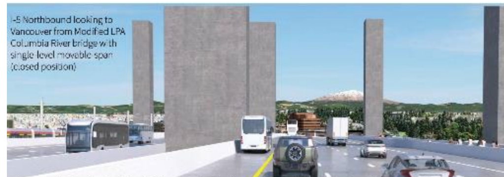
Photographic simulation of Modified LPA Columbia River bridge with single-level movable-span configuration